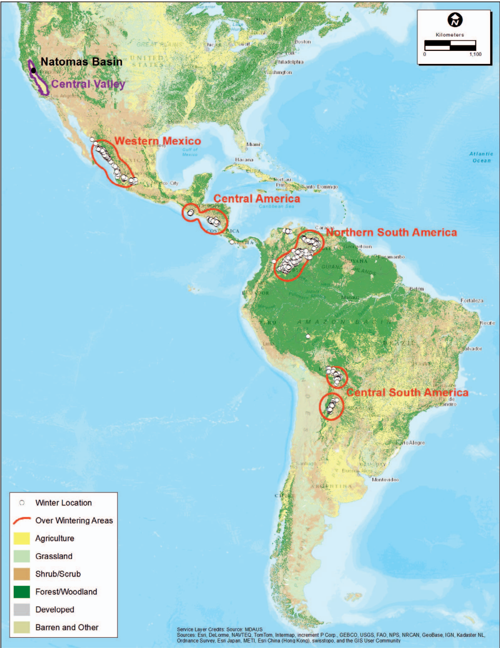
Figure 1. Natomas Basin breeding area, the Central Valley, California, USA, and wintering locations of 20 radio-tracked Swainson's Hawks that nested in the Natomas Basin during 2011–2015.