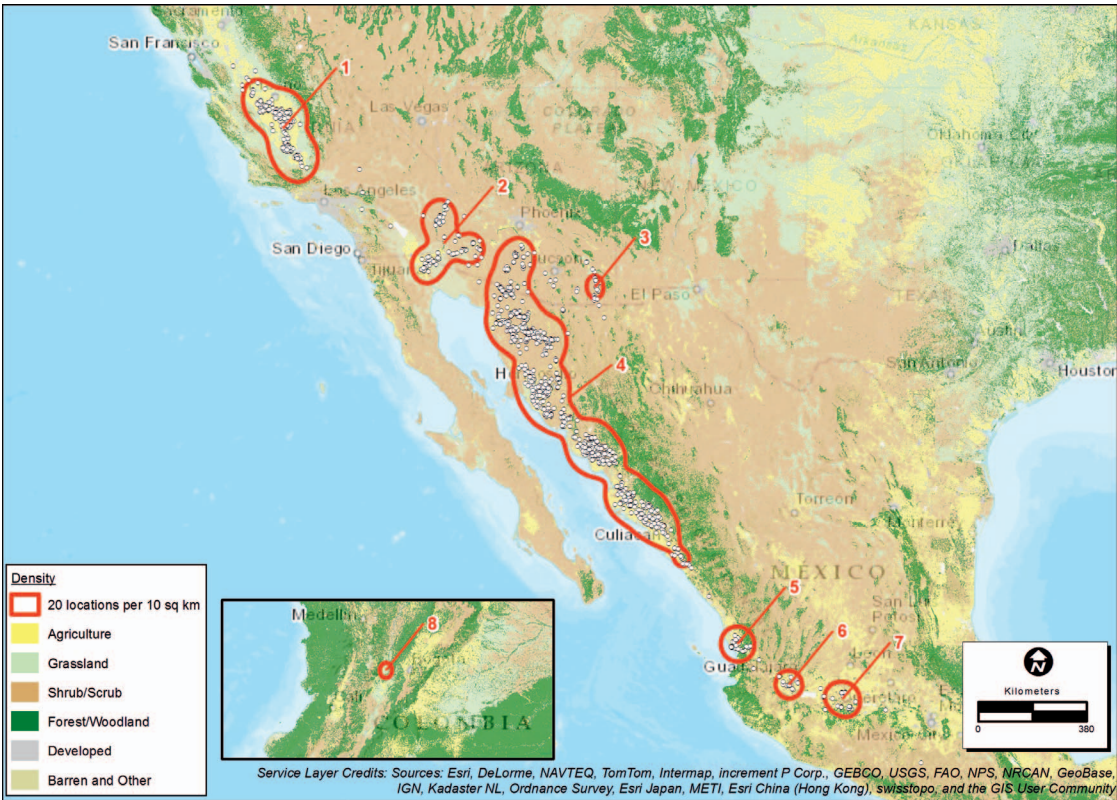
Figure 5. Eight areas of concentrated stopover (>20 locations/10 km 2 ) used during migration by Swainson’s Hawks that bred in the Central Valley, California, USA. See Table 5 for description of locations, frequency of use, and land-cover types.

Central Valley Swainson’s Hawks used certain areas along the southbound migration route as stopover habitats (Fig. 5). Nearly all (94%) of 1968 stopover locations occurred in eight regions (Table 4). The large Santa Cruz Valley–western Sonora–