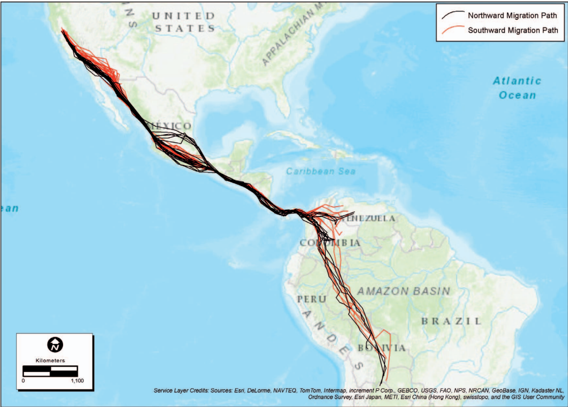
Figure 4. Southward and northward migration routes of Swainson’s Hawks that bred in the Central Valley, California, USA.

Migratory Stopover Use and Characteristics. CV Swainson’s Hawks spent a substantial amount of time in migratory stopovers during southward migration. All 20 tracked hawks used at least one stopover during southward migration, averaging 2.6 \pm 1.2 stops/trip for an average of 53 \pm 27