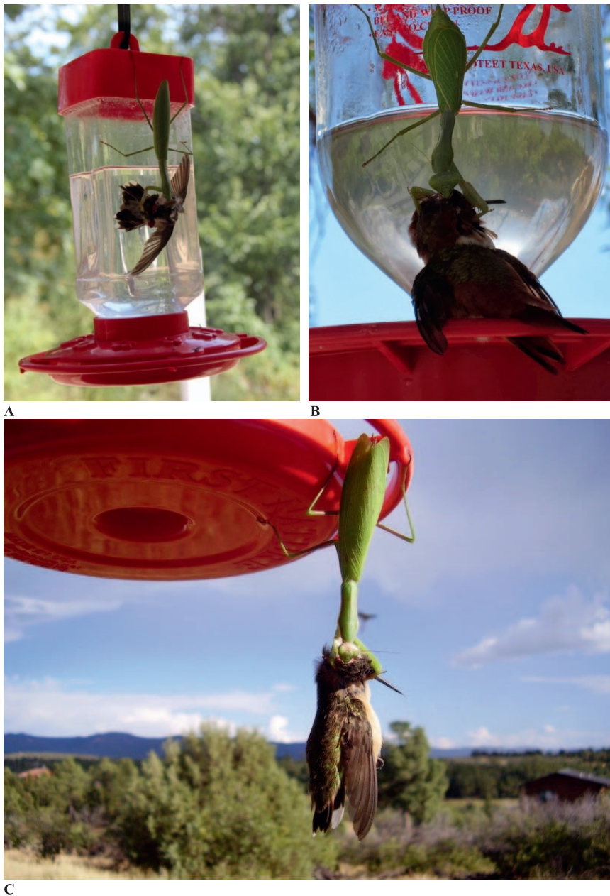
FIG. 1. Predation of birds by mantids at hummingbird feeder locations in the USA. (A) Tenodera sinensis eating a Ruby-throated Hummingbird ( Archilochus colubris) in Green Castle, Missouri ; (B) Stagmomantis limbata eating Allen's Hummingbird ( Selasphorus sasin) in San Juan Capistrano, California ; and (C) Mantis religiosa eating a Black-chinned Hummingbird ( Archilochus alexandri) in Millwood, Colorado.

The preponderance of predation events of hummingbirds in North America can be explained by several factors. First, North America is inhabited by some of the world's smallest birds,