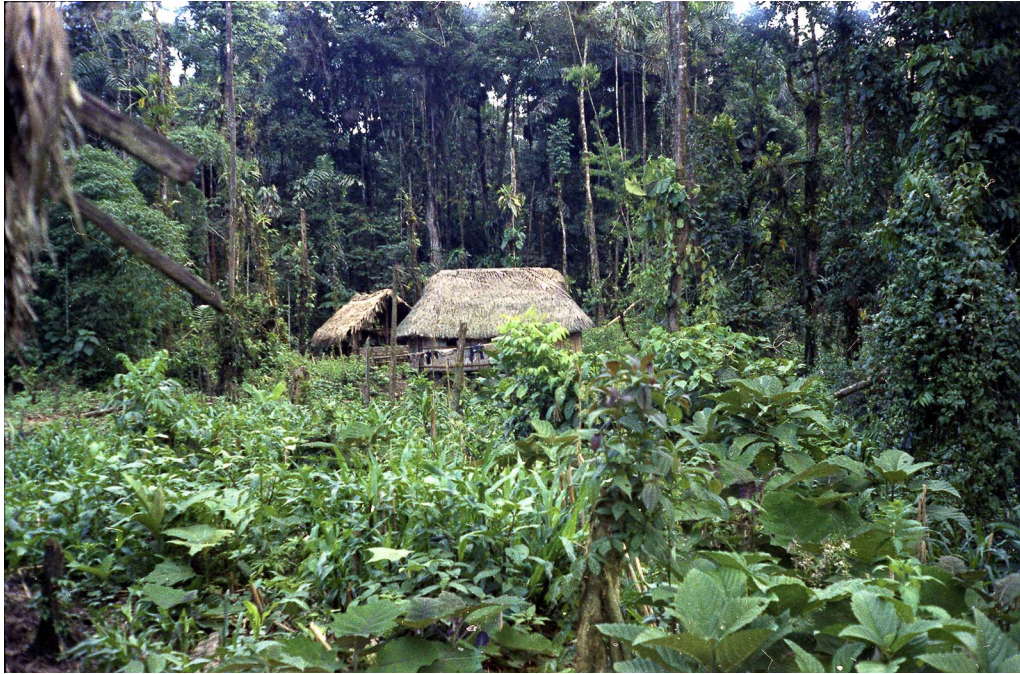
FIGURE 2 A Shuar homestead.

The state had little presence in the Amazon region at the beginning of the 20th century. The national government, headquartered in Quito, had several small garrisons on eastward-flowing tributaries of the Amazon river. A few settlements of mestizos , with no more than several hundred inhabitants, existed at the base of the Andes. Peruvian traders from downstream centers, like Iquitos, made occasional visits to these settlements. The Peruvian presence provoked concern among Ecuadorian elites. In 1889, to strengthen Ecuador's claim to these lands, the government authorized Salesian priests, an order of Catholic missionaries, to evangelize among the region's Amerindians (Bottasso 2011).