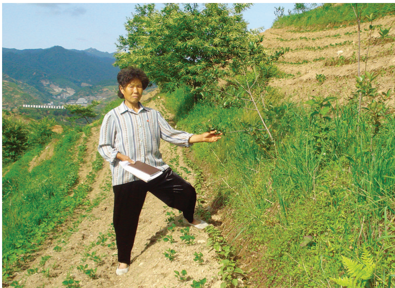
FIGURE 2 Selecting the right species not only helps to restore the ecosystem but can also contribute to local livelihoods. (taken in Suan County in 2012)

Currently, however, there is limited information on the selection of indigenous tree species for sloping-land agroforestry, in particular on participatory experiences in a highly centralized country like North Korea. Drawing on empirical data, this research highlights the importance of such an approach. It may produce valuable insights for participatory research and practice in 3 aspects: