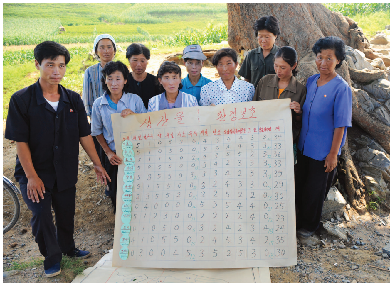
FIGURE 5 Quantitative results from participatory exercises can be especially convincing.

the National Agroforestry Strategy, which aims to scale up the pilot project to the entire country. The launch of the National Agroforestry Policy is a landmark for North Korea. However, large-scale implementation of participatory agroforestry still requires additional international aid and capacity building.