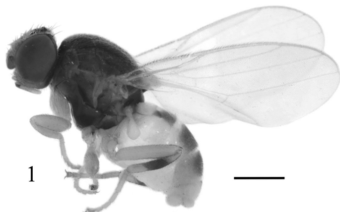
Fig. 1. Speccafrons digitiformis sp. nov. Male body, lateral view. Scale bar = 0.5 mm.

thick grayish microtomentum; first flagellomere as long as wide; arista brown except for basal segment yellowish brown, with short pubescence. Proboscis and palpus yellow with yellow setulae.