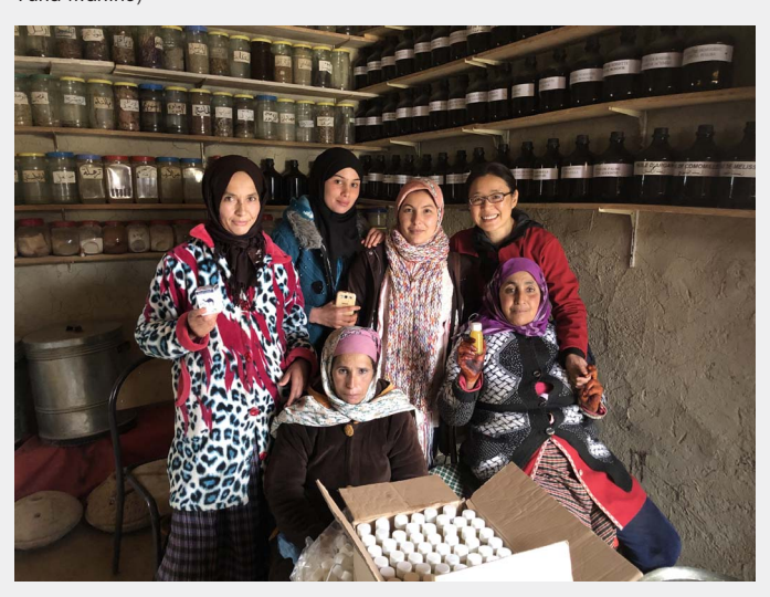
FIGURE 1 Medicinal plants: part of the Morocco Participatory and Integrated Watershed Management project's alternative livelihoods initiative.

management plans; at the community level, it linked local cooperatives to services, suppliers, and other agents to support their income generation (Figure 1). The project has also mainstreamed risk management into integrated watershed management from risk assessment, planning, design, and implementation.