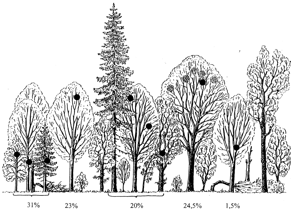
Fig. 3. Main types of the Hawfinch nest location in a high oak-lime-hornbeam forest of BNP. The illustration reprinted with the editors permission from Glutz von Blotzheim & Bauer (1997), but up-dated on larger material, N = 424 nests.

The Hawfinch nests in BNP are always placed in high and medium-size tree crowns. Of five types of nest location (Fig. 3), the four main are fairly similar structurally to each other. Most frequent (31%) are the nests at the main stem of a deciduous tree (often hidden in offshoots) or at a medium-size spruce crown. Three other locations are similarly frequent: in the mistletoe bunches, in uppermost vertical branches of old hornbeams and in branches of horizontally bent deciduous trees or on the lowest horizontal branches of huge spruces. Most exceptional (1.5%) are nests put Blackbird-like in a bifurcation of the bare main hornbeam stems, while the bush nests were not recorded at all. Disregarding described structural differences, the nests almost always were in sites with a free access from the air.