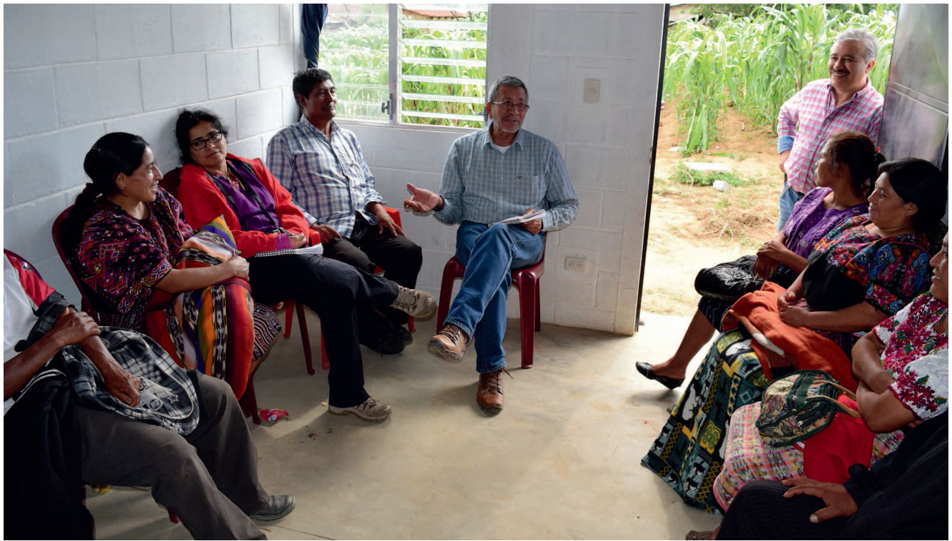
FIGURE 3 Focus group meeting in the department of Quiché.

farming systems in the region. Topics included family size, landholding size, maize production, maize consumption, and how farmers cope with maize deficits.