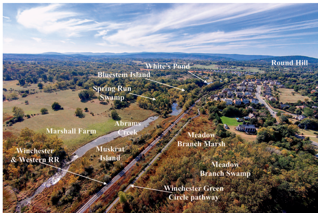
Figure 1. Abrams Creek Wetlands, adjacent land uses, and physiographic setting looking west across the Shenandoah Valley to the Allegheny Mountains. Boundary between Frederick County (left) and Winchester City (right) follows the railroad tracks. Headwaters of Abrams Creek are on Round Hill.

(Davis 2003; Mangino 2003a, 2003b; Gomes 2014).