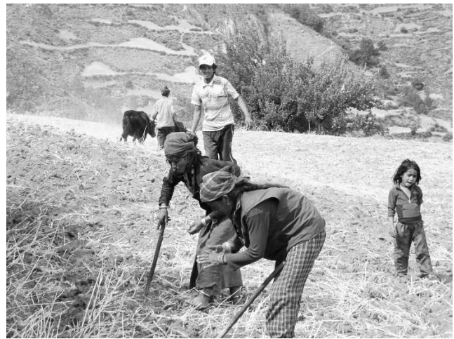
FIGURE 2 Dalit and Lama women, men, and a child involved in land preparation in Burgaon village.

them from going to school (Figure 2). Thus, the adaptive strategy of planting drought-resistant crops such as fapar reinforced gendered patterns of agricultural work, because women assumed a disproportionate share of farm production and household reproduction. The resilience of these gender practices shapes adaptive strategies and tends to maintain, if not exacerbate, the disadvantaged position of the women farmers under study.