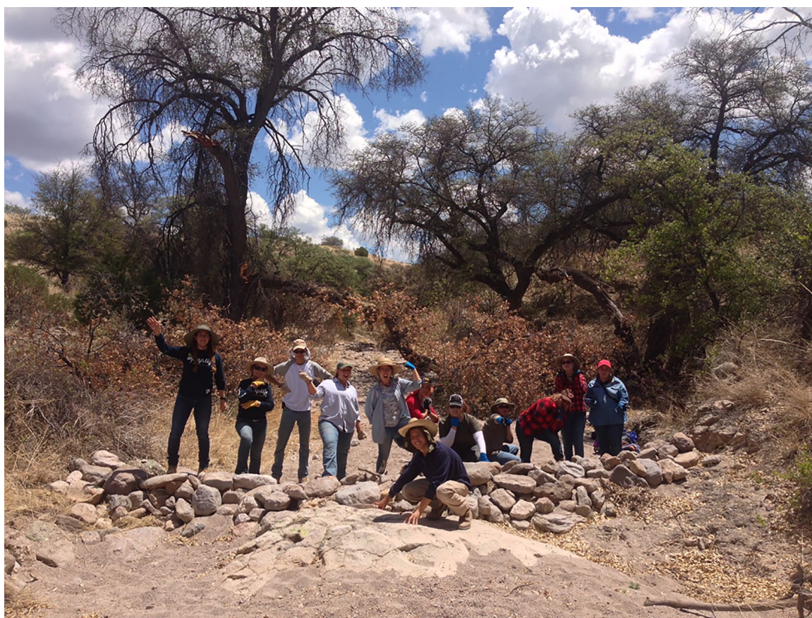
Image 1. BECY crew with rock structure.