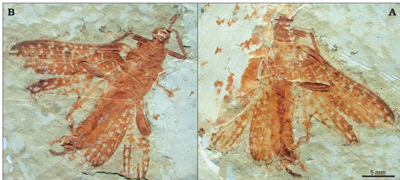
Fig. 1. Susumaniid stick insect Renphasma sinica gen. et sp. nov., holotype A31857, Beipiao City, China, Lower Cretaceous, Yixian Formation. Photographs of print (A) and counterprint (B).

straight, reaching posterior wing margin, a weak but poorly preserved anterior branch of CuP reaching MP+CuA very near to its base; two simple and straight anal veins, anal area 1.3 mm wide.