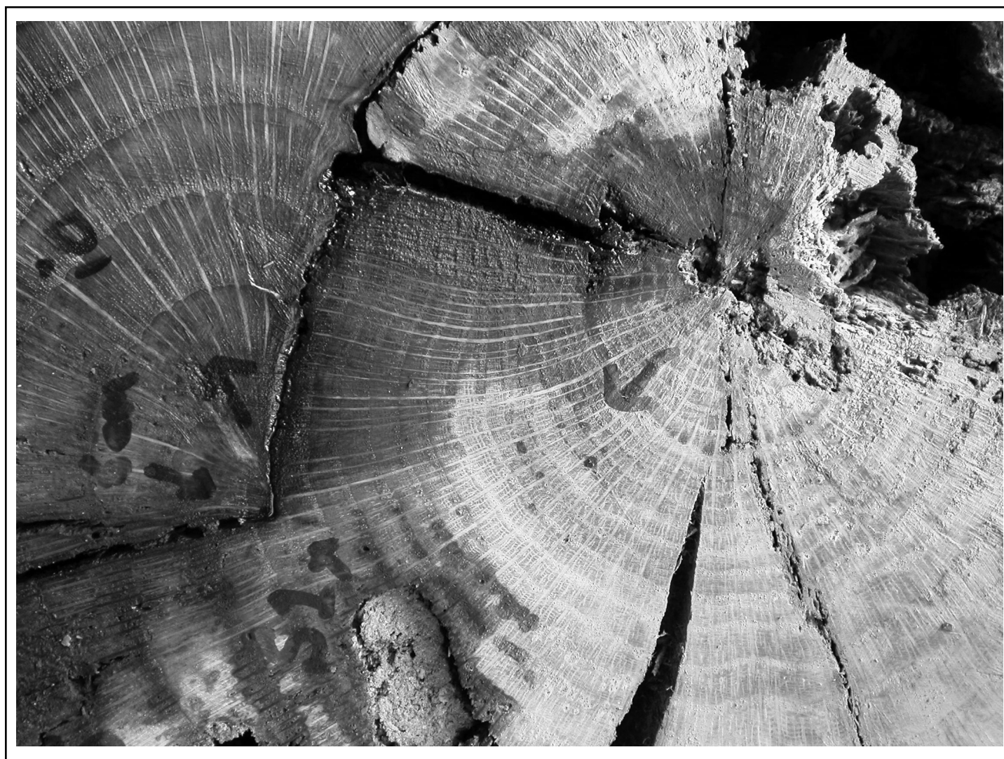
Figure 2. Example of fire scarring within a black oak cross-section (S7 in Figure 1), collected in 2009, High Park, Toronto. Subsequent ring growth exhibited sealing over the scar and an episode of increased ring width.

individuals in a burn. We therefore used the following corroborative fire event indicators: (1) the timing of establishment of multistemmed individuals (three of the 14 cross-sectioned individuals), which, among oaks, indicates basal resprouting in response to having been top-killed as a sapling, typically by fire or other disturbance (Keeley 1992; Del Tredici 2001), and (2) the presence of even-age cohorts in the pre-settlement period, which is suggestive of a fire-induced recruitment period (Abrams 1992; Peterson and Reich 2001). Our sample of cross-sections was also used to determine establishment dates ( n = 14 ). With respect to multistemmed individuals, resprouting following fire disturbance occurs simultaneously across all