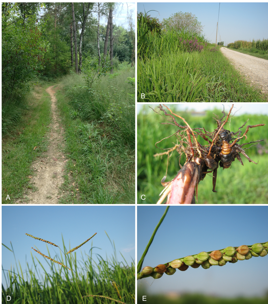
Fig. 1. Paspalum thunbergii in Italy. – A: forest path in Boscaccio; B: roadside ditch in Mortara; C: rhizome; D: inflorescence; E: spikelets. – A: Boscaccio; B–E: Mortara.

pubescent, especially along the margins (vs acuminate at the apex, with long-ciliate margins). Moreover, P. thunbergii typically has upper glumes that are 3-veined with a very prominent central vein and marginal lateral veins (vs 5–7-veined upper glumes in P. dilatatum ). Also, both species are ecologically rather different (see below). Paspalum thunbergii and P. dilatatum locally have likely been confused in Italy or elsewhere in Europe. However, a revision of herbarium specimens of the latter in some herbaria (BER, BR, HBBS, GENT, MSNM, PAV and TO; acronyms according to Thiers [continuously updated]) only yielded one supplementary record of P. thunbergii (see specimens examined).