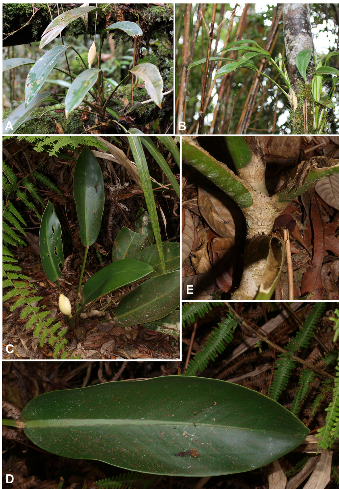
Fig. 1. Scindapsus kinabaluensis – A & B: flowering (A) and early fruiting (B) climbing plants in habitat; C: terrestrial plant flowering in habitat; D: leaf blade, adaxial view; E: detail of ageing portion of stem; note the corky, cracking epidermis. – A & B from Kartini BORH 2213; C–E from Wong Sin Yeng & P. C. Boyce AR-4738.