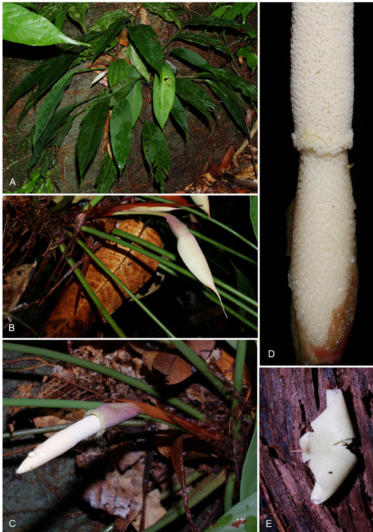
Fig. 3. Schismatoglottis nicolsonii – A: plants in habitat, edge of sandstone waterfall, Bako N. P.; B: flowering plant in habitat; C: inflorescence at onset of staminate anthesis, with spathe limb shed; D: detail of pistillate zone and lower part of staminate zone. Note that staminate zone is fertile to base; E: spathe limb shed during onset of staminate anthesis. – All from P. C. Boyce & al. AR-2106. – Photographs by Peter C. Boyce.