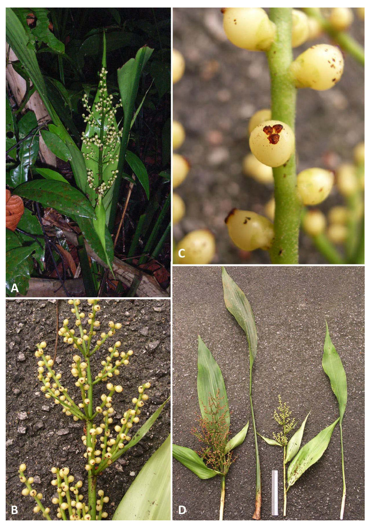
Fig. 1. Hanguana exultans – A: flowering plant in habitat; B: infructescence, note the rather sharply ascending branches; C: detail of the ventrally gibbose-ellipsoid fruits ripening pale yellow with a sessile stigma comprising 3 separate (not connate) orange brown lobes; D: median leaf and inflorescence of H. pantiensis (left) compared with H. exultans (right). – A–D: Siti Nurfazilah & al. HA-55 ; images © Rosazlina Bt Rusly.