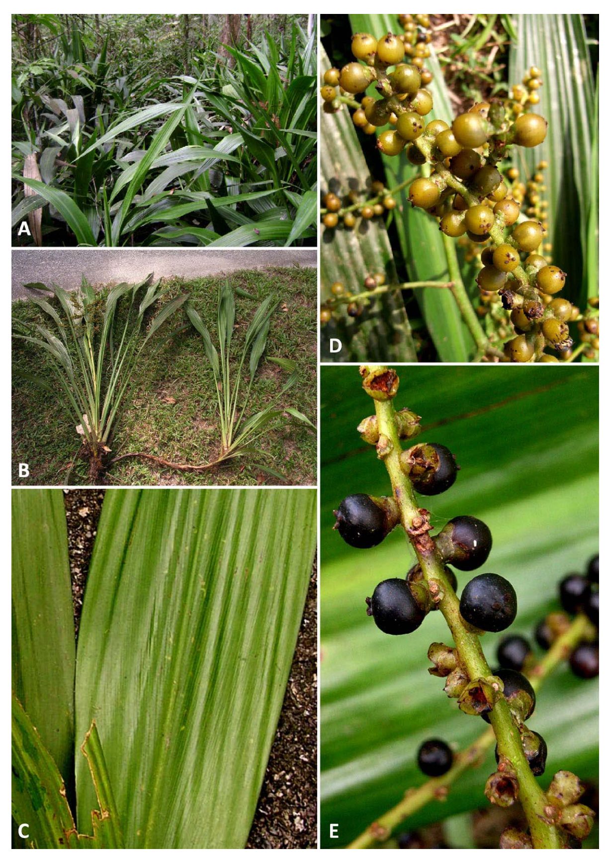
Fig. 2. Hanguana nitens – A: plants in habitat, note the arching (not stiffly erect) leaves; B: portion of a mature plant showing a stolon and the conspicuous, long (^{2}/_{3}-^{1}/_{4} of the leaf length) pseudopetiole; C: plicate leaf blade; D: portion of an immature infructes-cence, compare the separate, erect, pointed stigma lobes with those of H. malayana (Fig. 7B); E: ripe fruits. – A–E: Siti Nurfazilah & al. HA-48