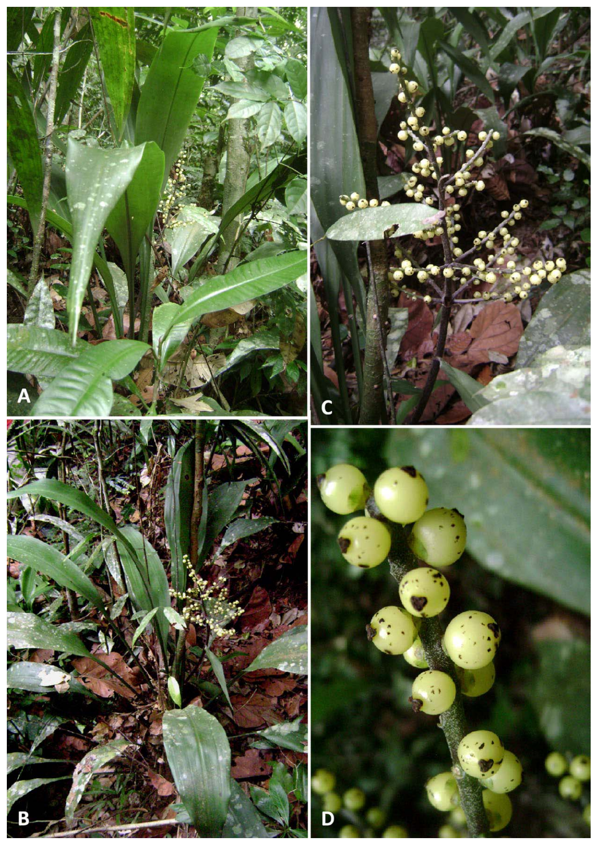
Fig. 5. Hanguana stenopoda – A–B: plants in habitat; B: detail of infructescence, note the partial inflorescences each with only 2 or rarely 3 branches and that the subtending bracts have fallen; D: ripe fruits with opaque tepals, briefly stipitate stigma, with the lobes connate, deep chocolate brown, and the fruit with conspicuous black speckles. – A–D: Siti Nurfazilah & al. HA-60 ; images © Siti Nurfazilah Bt Abdul Rahman.