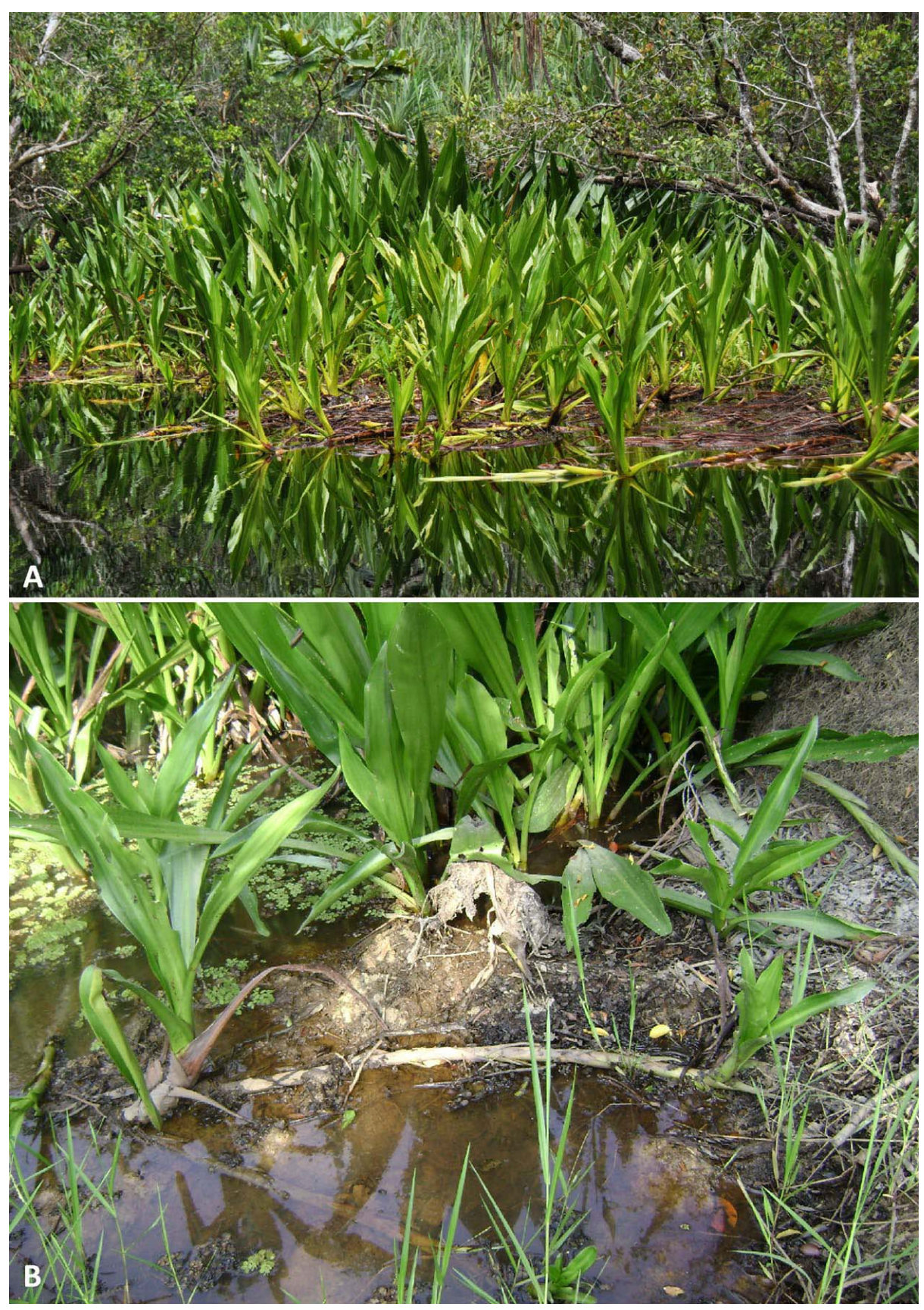
Fig. 6. Hanguana malayana – A: plants in habitat in Maludam N. P., Sarawak, note the stiffly erect leaves and the stolons floating on the water surface; B: detail of semi-terrestrial stolons in habitat, Perak.