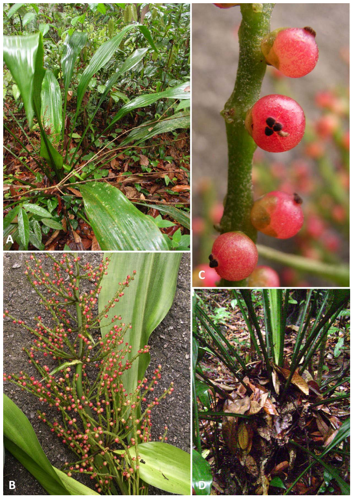
Fig. 3. Hanguana pantiensis – A: plant in habitat, note the dense panicle carried down in the leaves; B: detail of infructescence, note the dense panicle with branches of the partial inflorescences ascending; C: ripe fruits, with the stigma obliquely to sublaterally inserted by longitudinally bending of ovary; D: leaf bases showing litter-trapping. – A–D: Siti Nurfazilah & al. HA-56 ; images © Rosazlina Bt Rusly.