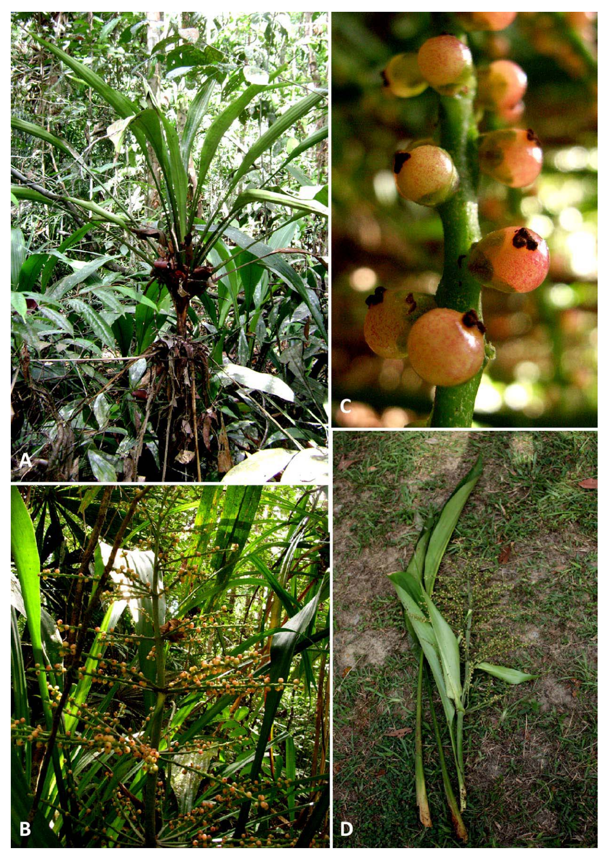
Fig. 4. Hanguana podzolicola – A: plant in habitat showing the tall, leafless stem produced by older plants; B: detail of infructescence, note the open nature of the panicle and the spreading branches of the partial inflorescences; C: ripe fruits, with the stigma obliquely to sublaterally inserted by longitudinally bending of ovary; D: median leaf and inflorescence. – A–D: Siti Nurfazilah & al. HA-49 ; images © Rosazlina Bt Rusly.