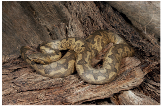
Figure 9. Candoia paulsoni mcdowellii from Milne Bay Province, Papua New Guinea.

Conservation Status. This subspecies has not been assessed, though it is likely persecuted (O'Shea, 1996).