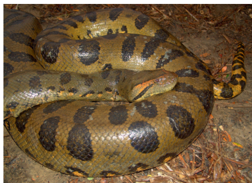
Figure 7. Eunectes murinus from Estado Apure, Venezuela.

Taxonomy. Originally described as Boa murina by Linnaeus. When Wagler (1830) described the genus Eunectes , B. murina became the type species. Aside from Stull (1935) resurrecting the old Linnaean name scytale to replace murinus , and the epithet