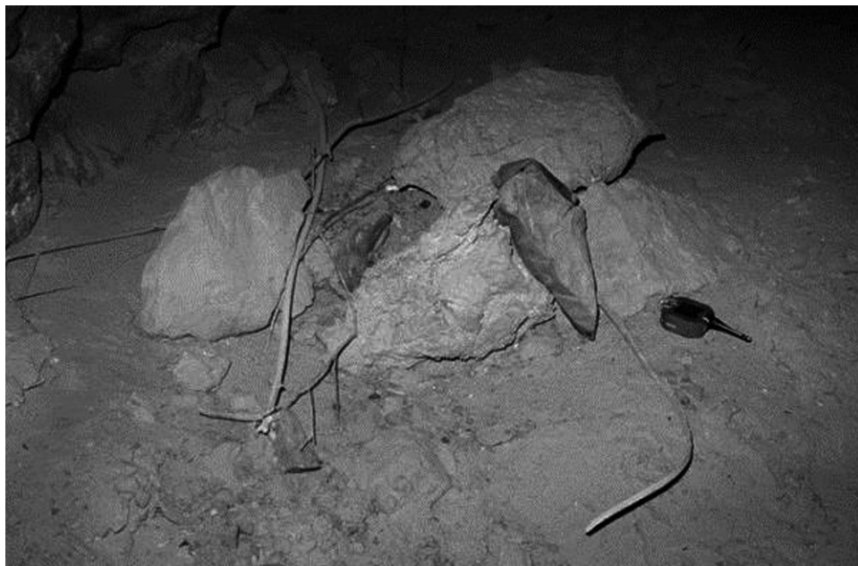
Figure 2. One of eleven cairns found in Crescendo Cave, Grand Canyon, with several long, unmodified and split sticks in association. This cairn is Cairn 5 as described by Emslie et al. (1995).

fawn survival. The higher mortality was caused by a combination of lack of water and absence of nutritious forage. Desert mule deer ( Odocoileus hemionus Rafinesque) are similarly affected. Smith and LeCount (1979) completed a nine-year study of this species in Arizona and found a strong correlation between winter precipitation, forb and small shrub productivity, and fawn survival. Lawrence et al. (2004) studied deer survival for nearly three years in southwest Texas. They also found a direct correlation between periods of drought with adult female and fawn survival.