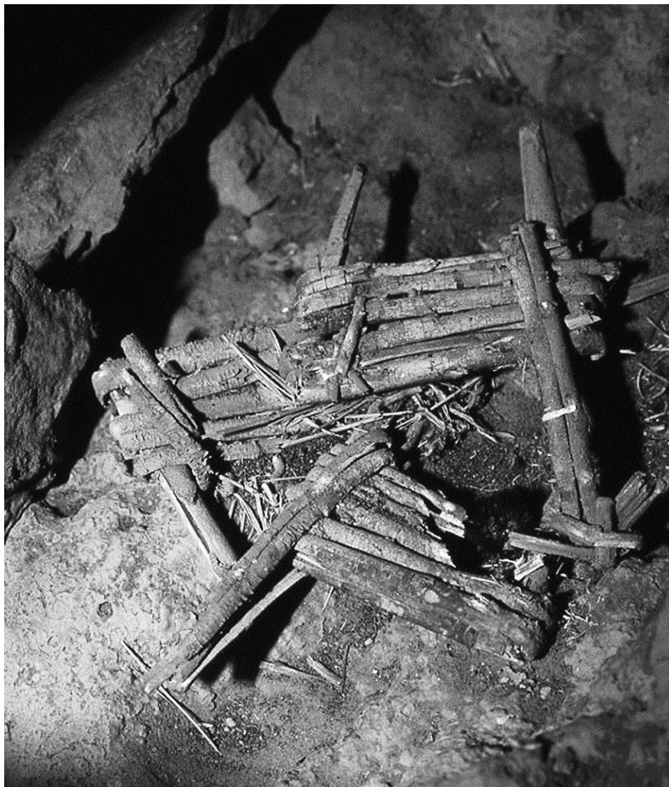
Figure 4. A cache of three split-twig figurines placed in a circular pattern as found under a cairn at Rebound Cave, Grand Canyon. This cairn is Cairn 9 as described by Emslie et al. (1995).

All 15 dates from Grand Canyon indicate a narrow temporal range of 4390–3100 BP for this complex (Table 1 and Fig. 3). Although this range extends over 1000 years, if the oldest and youngest dates are removed from consideration, the remaining dates form a tighter cluster ranging from 4095–3530 BP, or a period of only about 500 years. These remaining dates also form several distinct clusters in age. For example, the older dates from Stantons, Rebound, and Right Eye caves are essentially contemporaneous in the 4000s BP, with that from Horn Creek nearly so. The date from Five Windows Cave 3 is identical to one other date from Rebound Cave at 3850 BP. In addition, other dates from Rebound Cave in the 3700s BP, with