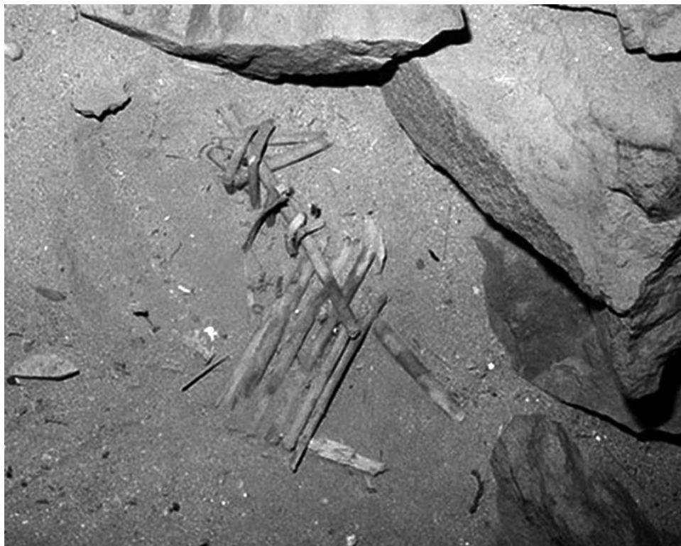
Figure 1. A typical split-twig figurine as found in situ at Shrine Cave, Grand Canyon.

time period between 4100–3500 BP. The exact role of these objects in Archaic culture will never be known, but the most logical explanation is that they were used in a hunting ritual as a form of offering to enhance the hunter's success. This interpretation is based on the discovery of at least six figurines with a small spear in their sides, and six others with an artiodactyl's dung pellet purposely placed inside. Furthermore, all figurine sites in Grand Canyon were only used for this ritual by the Archaic hunters; no evidence for habitation has been found at any of these sites. Figurines that have been found at sites outside Grand Canyon are often constructed differently from the Grand Canyon artifacts, do not date to the same period and are usually much younger in age, and likely did not have a similar function (Coulam and Schroedl 2004).