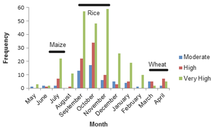
Figure 2. Month-wise HEC intensity in Nepal (2007–2012). Each month damages are presented in percentage of total damages. Traditional crops growing and harvesting seasons were shown by lines above the months.

Binary logistic regression demonstrates that only the number of crops grown on farms, growing of rice, and presence of large maize fields had statistically significant associations with crop damages ( \chi^2 = 64.72 , p < 0.0001 ). The frequency