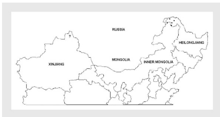
Figure 1. The wolverine distribution in China is separated into an western subpopulation with uncertain distribution (shown by the question mark) and a eastern subpopulation with known distribution (shown by dots).

clining or disappearing wolverine populations in most states of the USA (Nowak & Paradiso 1991). Wolverine populations also declined in Scandinavia and Russia during the last century (Landa et al. 2000).