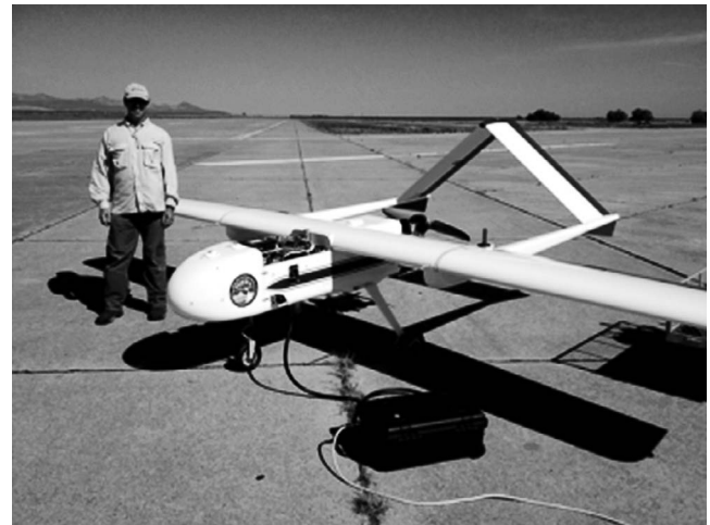
Figure 1. The Sensor Integrated Environmental Remote Research Aircraft (SIERRA) on the tarmac at NASA's Crows Landing Airport in California.

These SUAVs have advanced designs to carry small payloads and integrated flight control systems, giving them semiautonomous or fully autonomous flight capabilities. In autonomous UAVs, the acquisition of remote-sensing data is preprogrammed with flight planning software that can calculate waypoints for image acquisition based on the desired ground resolution, amount of image overlap, and area to be surveyed. Digital cameras are commonly part of the payload. During the flight, the UAV's autopilot can communicate via a telemetry link to a ground station running flight control software (Hugenholtz, 2012). For example, the AeroVironment RQ-14A "Dragon Eye" has a 110-cm wingspan and weighs about 2.5 kg. Launched by hand or with a bungee cord, the small plane is controlled by GPS coordinates entered into its guidance system with a standard laptop computer. Once aloft, it can transmit video images of the coastal landscape in real time (Edwards, 2009).