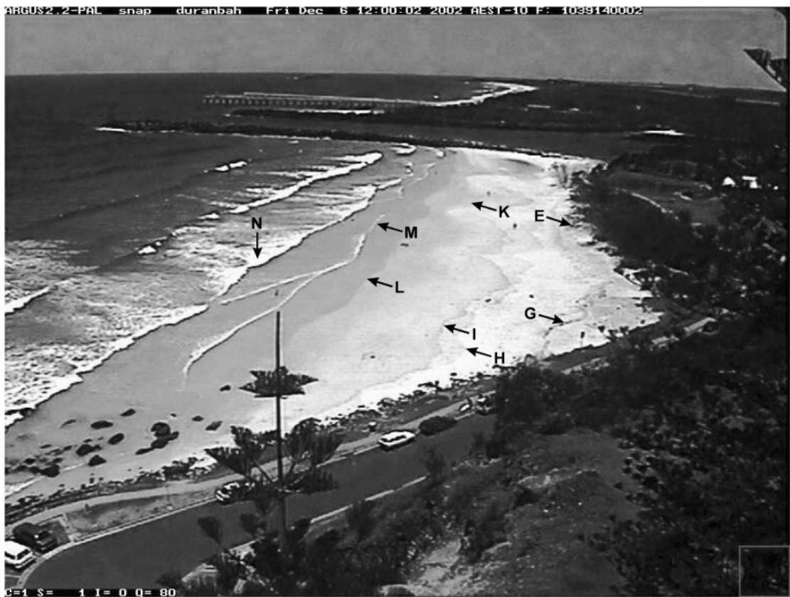
Figure 2. An example of a range of visibly discernible shoreline indicator features, Duranbah Beach, New South Wales, Australia. For key, see Figure 1.