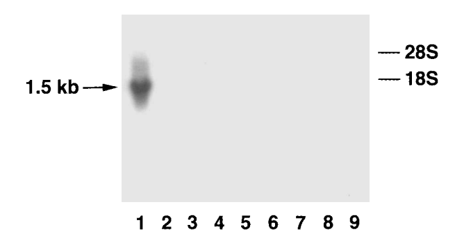
Fig. 3. Northern blot analysis of RNA from various organs of Bufo japonicus for detection of mRNA for tGCase. Total RNAs of the stomach (lane 1), brain (lane 2), kidney (lane 3), large intestine (lane 4), liver (lane 5), lung (lane 6), olfactory epithelium (lane 7), pancreas (lane 8) and small intestine (lane 9) were hybridized with the radiolabeled tGCase cDNA. The amount of the applied RNA was 15 \mu g in each case except for the stomach, where 5 \mu g RNA was applied.

Comparison of the amino acid sequence between the putative toad gastric chitinase (tGCase) and known vertebrate chitinase family proteins revealed homologies of 75.9, 70.3, 52.1 and 50.2% with mouse AMCase, bovine CBPb04, toad pancreatic chitinase and human chitotriosidase, respectively. Like these vertebrate chitinases, this putative tGCase was predicted to contain an N-terminal catalytic domain and a C-terminal chitin-binding domain (Fig. 2).