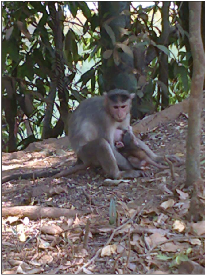
Figure 2. Bonnet macaque ( Macaca radiata ) mother and young, Goa, India.