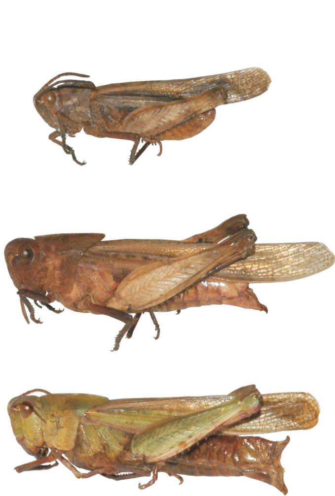
Fig. 1. Specimens representing typical C. viridifasciata (male = 1 st specimen, females 2 nd and 3 rd ). Note the lack of markings on the tegmina and hind femur, as well as the brownish to blackish hind tibiae. These specimens were collected in Lancaster County, Nebraska in April 2006. See Plate VII for color version.