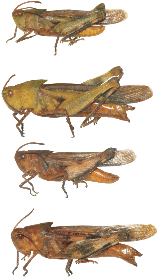
Fig. 2. Nebraska specimens sharing some characters with C. australior . Note the markings on the tegmina (all) and hind femur (top male; males = 1 st and 3 rd specimens, female = 2 nd and 4 th ), as well as the blue hind tibiae. These specimens were collected in Lancaster and Pawnee Counties in Nebraska in July 2006. See Plate VII for color version.