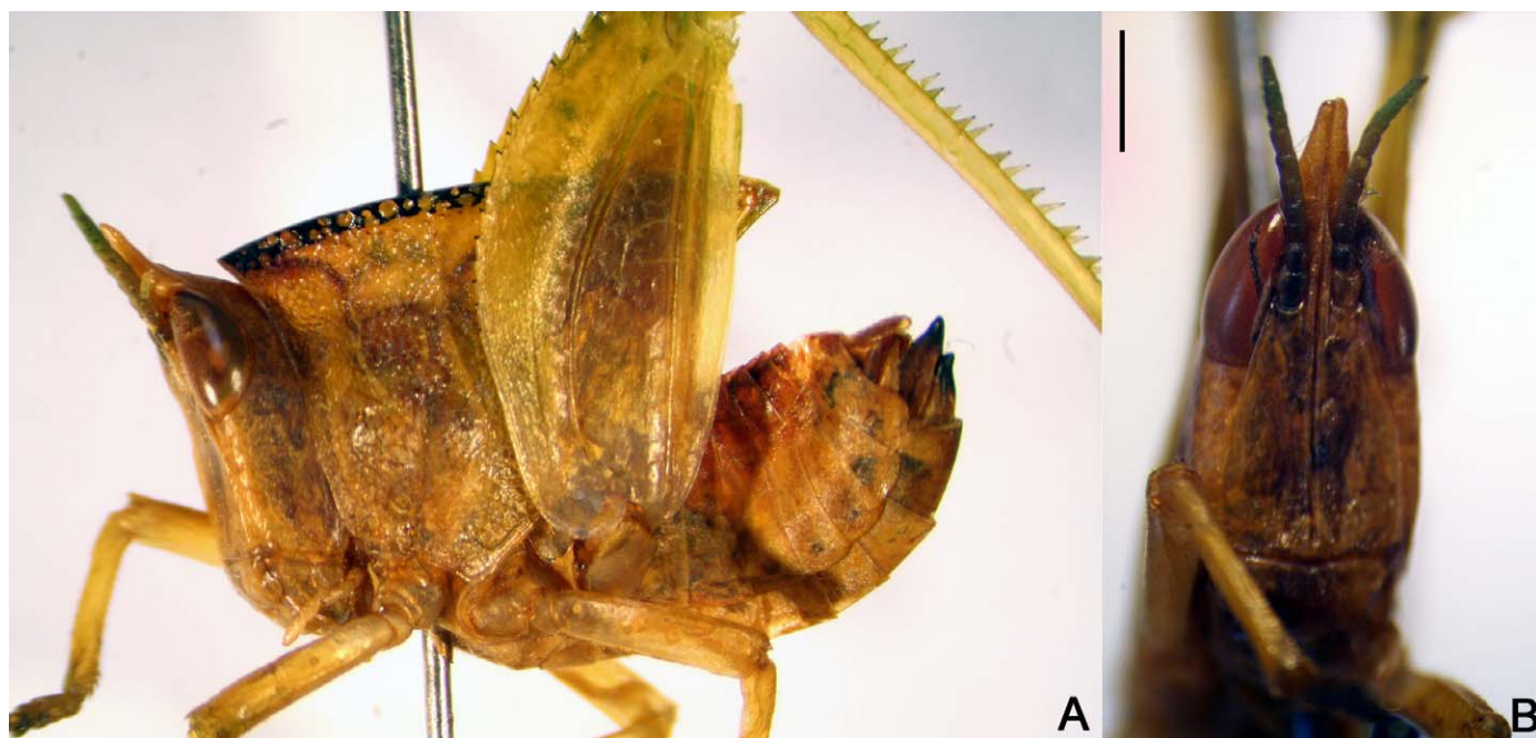
Fig. 3. Female paratype (last instar) of Plagiotriptus discolor n.sp.; A. Habitus, lateral view; B. Face. Scale bar: 1 mm. For color version, see Plate VI.