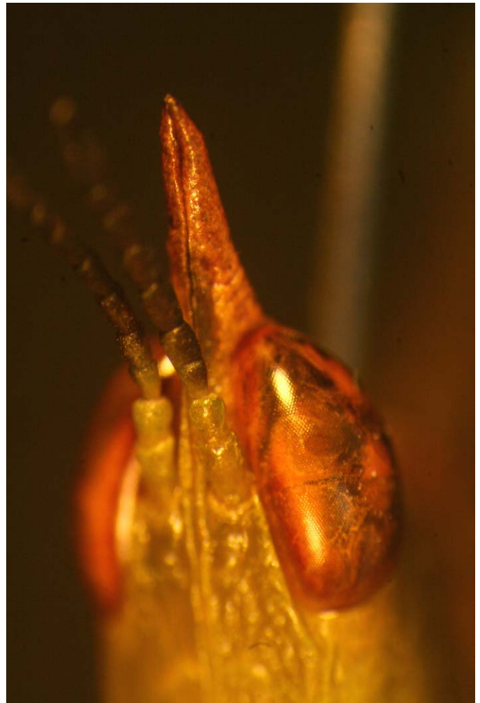
Fig. 2. Dorsal view on part of face and elongate sulcate fastigium verticis of male Plagiotriptus discolor n. sp. For color version, see Plate VI.

Co-occurring Saltatoria species. — Rhainopomma montanum (Kevan, 1950), Parasphena teitensis Kevan, 1948, Aerotegmina sp., Melanoscirtes taitensis Hemp, 2010, Ixalidium haematoscelsis Gerstaecker, 1869, and Gymnobothroides pullus montanus (Kevan, 1950).