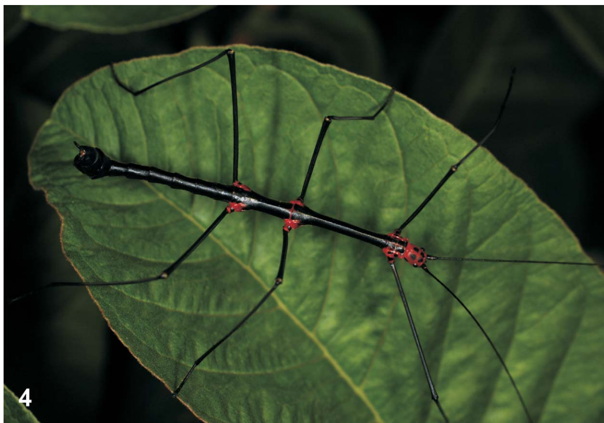
Fig. 4. Oreophoetes topoense n. sp. ♂ PT (in OC). See Plates.