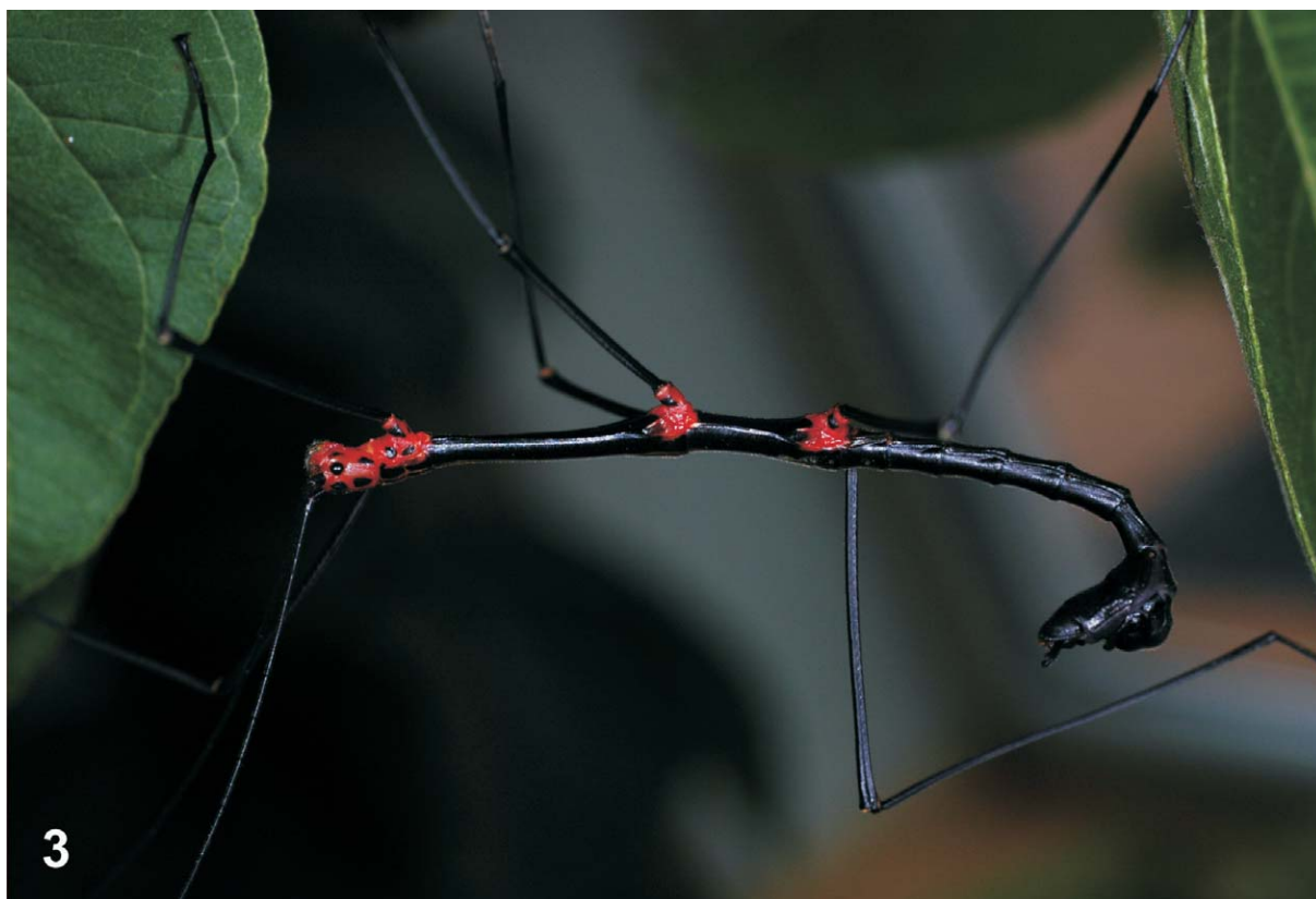
Fig. 3. Oreophoetes topoense n. sp. ♂ PT (in OC). See Plates.