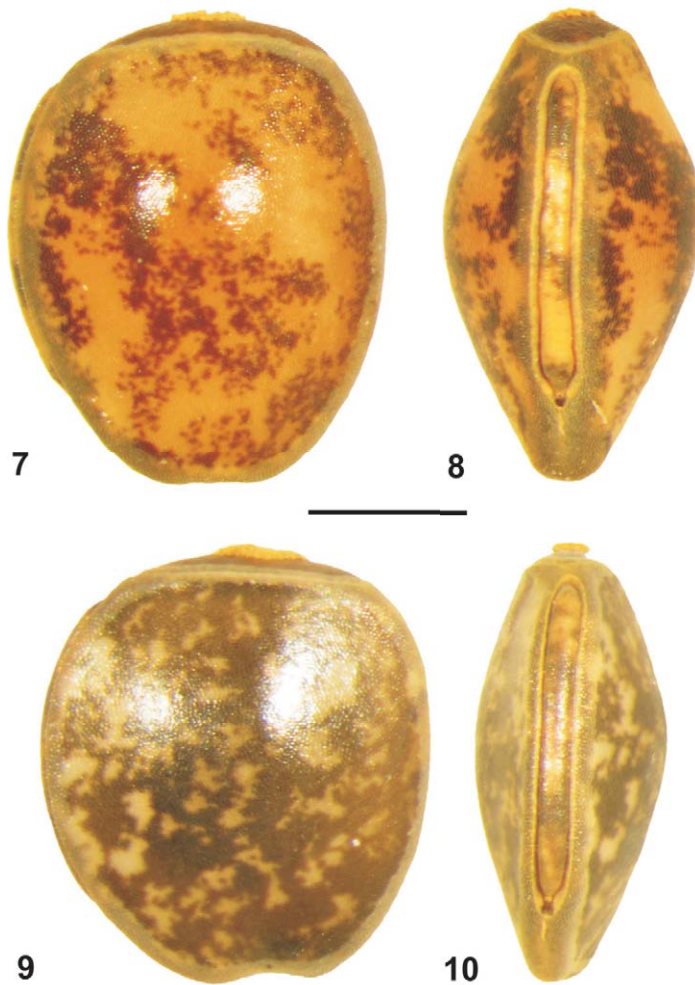
Figs 7-10. Eggs of Oreophoetes spp. [scale = 1mm]. 7. O. peruana peruana (Saussure, 1868), lateral view; 8. O. peruana peruana (Saussure, 1868), dorsal view; 9. O. topoense n. sp., lateral view; 10. O. topoense n. sp., dorsal view. See Plates.

Cerci yellow to pale greenish with the apical portion black. Legs mostly black with knees bright yellow to pale greenish. Femora each with one distinct creamish-white transverse band postmedially; tibiae with two creamish white transverse annulations in median portion. Tarsi black with ventral surface dark brown.