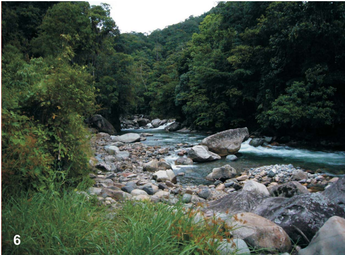
Fig. 6. Type locality of O. topoense n. sp., near the Rio Topo (Tungurahua Province, Ecuador) at 1600 m. See Plates.