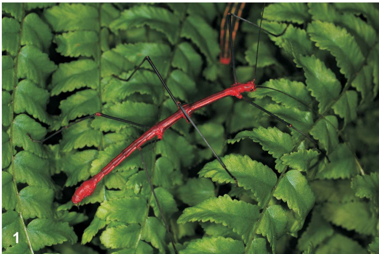
Fig. 1. Oreophoetes peruana peruana (Saussure, 1868), ♂, captive reared. See Plates.