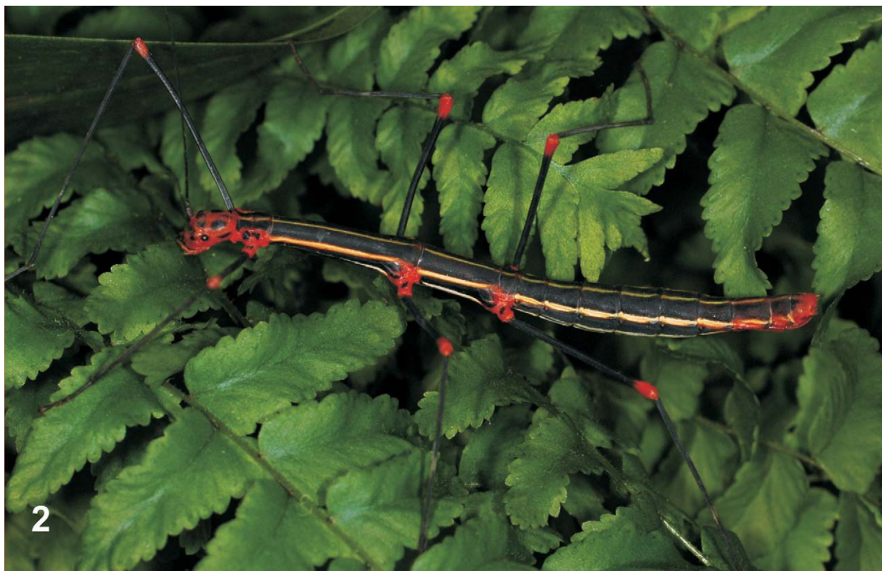
Fig. 2. Oreophoetes peruana peruana (Saussure, 1868), ♀, captive reared (orange variety). See Plates.