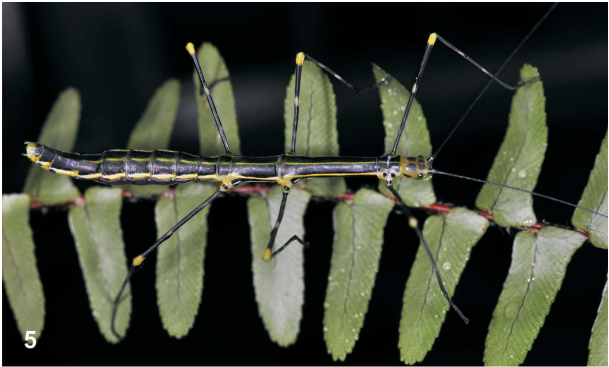
Fig. 5. Oreophoetes topoense n. sp. ♀ PT (in OC). See Plates.