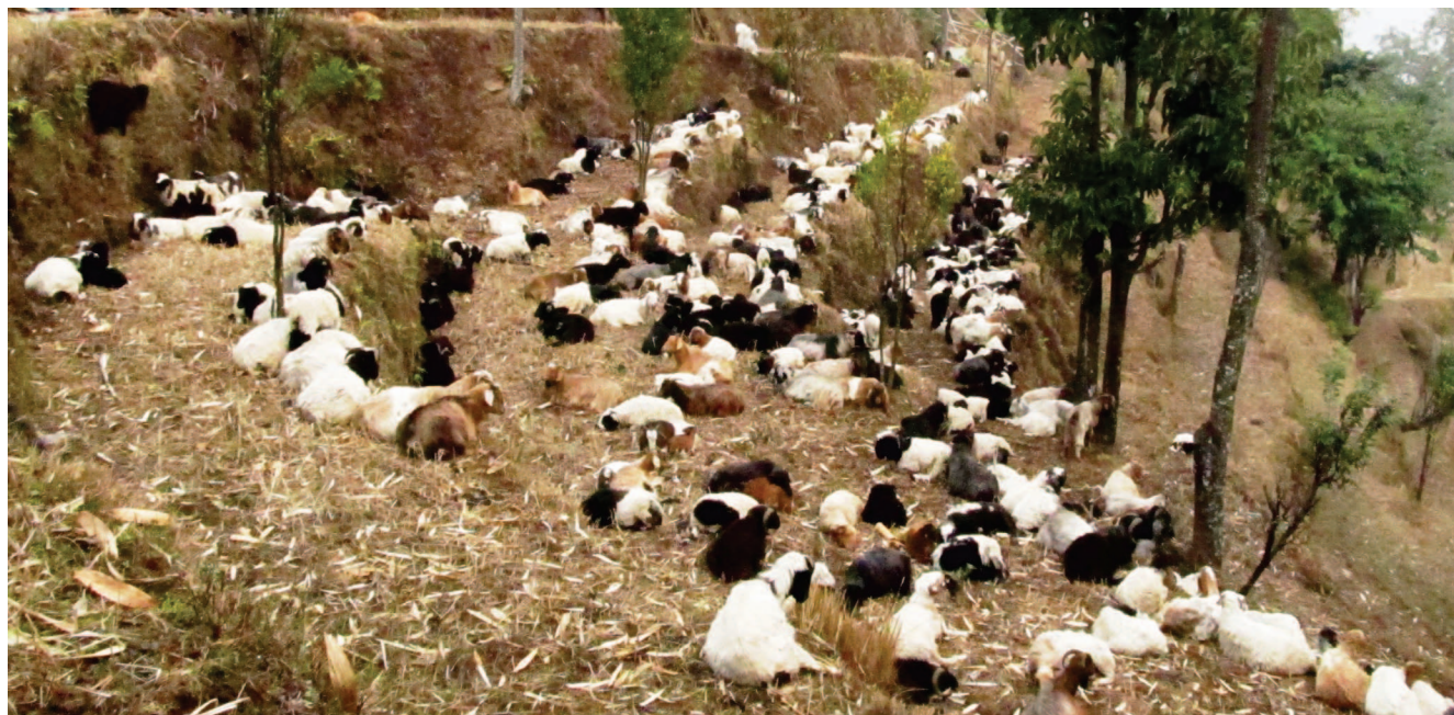
FIGURE 2 A sheep and goat herd on the way to winter pastures.

direct and indirect contributions. The major contribution was cash income from the sale of livestock. As reported by interviewees, each herd owner sells about 15–25 livestock per year (about 7% of the total). This generates a total of about 3 million NRs ( \approx US$ 35,000) for the 14 goths in the research area in Ghermu VDC, or an average gross annual income of about US$ 2500 per herder. The indirect contributions reported by informants included provision of manure for farmlands, employment, as well as cultural values, as explained by a herder interviewee: “Sheep have a cultural and spiritual value in the Gurung community, and we need sheep in most of our religious and cultural functions.”