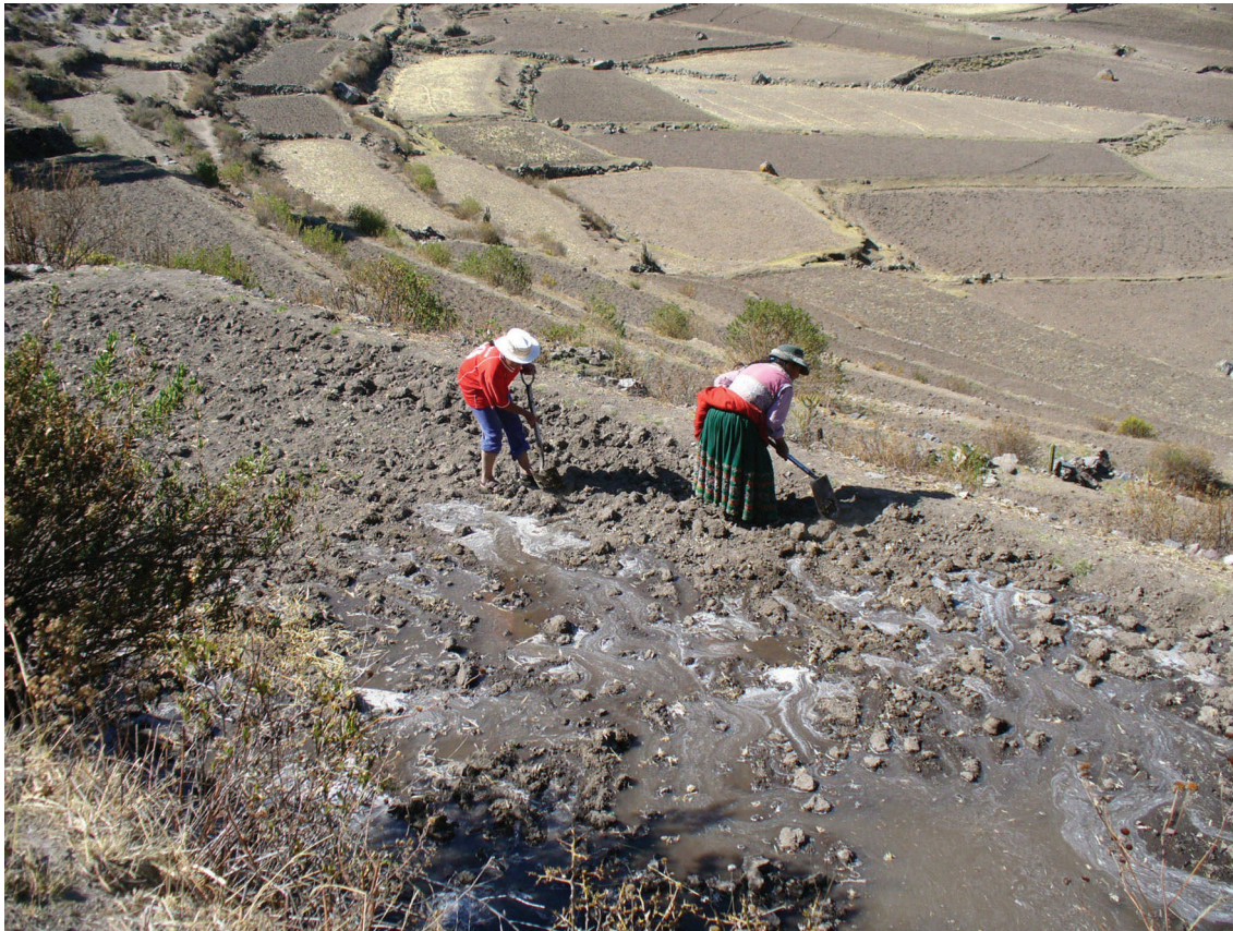
FIGURE 2 The Colca Valley is famed for its terraces and its aridity. This photo shows the steep terraced landscape and local irrigation practices under which land is carefully maintained and irrigated with available water.

PROFODUA (Programa de Formalización de Derechos de Uso de Agua [Program to Formalize Rights to Use Water]). PROFODUA granted and formalized the use of water rights individually and in blocks, thus avoiding use of the term “collective rights.” Such rights could be traded or exchanged by their holders, which meant that conditions were in place for a market in water rights to emerge. Some Andean communities, including the Colca Valley, resisted the implementation of PROFODUA. They demanded the recognition of their communal right to water and rejected individual entitlements. Because of this contentious issue, PROFODUA only formalized the individual water rights of users in blocks of the coastal irrigation systems (Vera 2011).