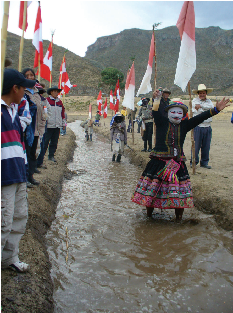
FIGURE 3 Water management in Coporaque includes many customary practices that play a key role in reproducing local water rights, alongside the standardized rules of the Water User Association.

with local preferences in irrigation management, still runs across the communities of the Colca Valley. As shown here, the nature of struggles to claim water and take-up of new water governance rules and recommended irrigation practices do vary across the Colca Valley, and these differences demonstrate the ethno-politics of water governance emerging alongside the state Water Law (Vera 2011). Ethno-politics show us the processes by which communities, while still maintaining their collective identity, increase their security of water supply not only through conflictive processes of cultural politics or frontal resistance, but also through alternative and creative processes; whereby people appropriate, adapt