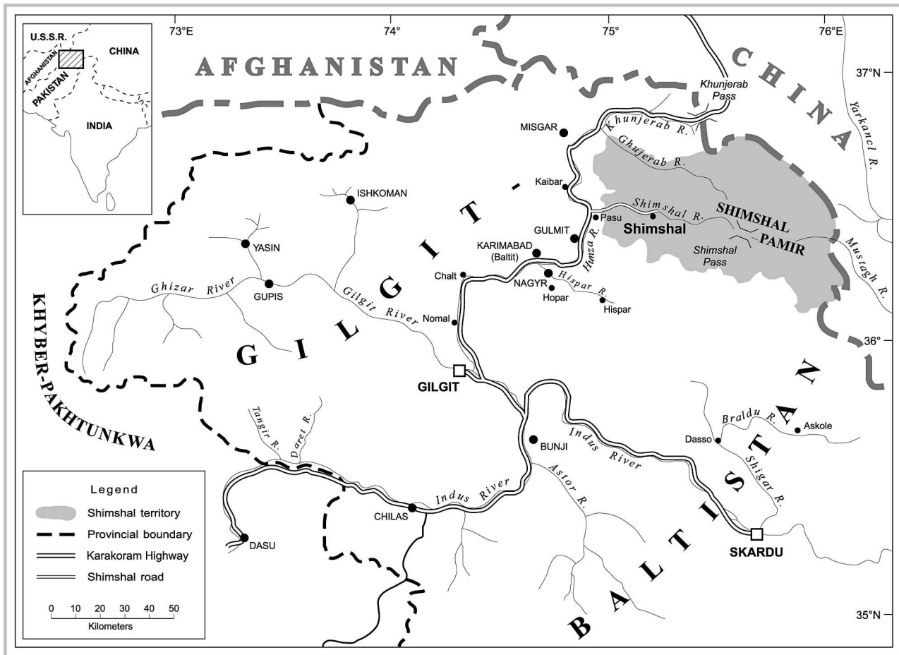
FIGURE 1 Location of Shimshal in the Gilgit-Baltistan province. (Map by David Butz)

Road building is an important aspect of rural development in the global South (Obut 1986; Wagner 1990; Njenga and Davis 2003). Governments and development organizations largely assume that as roads increase rural accessibility and the circulation of people and goods, they also bring greater prosperity and an easier, more secure way of life (Wilson 2004). However, little development studies research has systematically analyzed the implications of roads for communities that are newly connected to the “outside.” Important research exists on the social effects of rural roads in northern Pakistan (Grotzbach 1984; Allan 1986, 1989; Ispahani 1989; Kreutzmann 1991, 1993, 1998; Uhlig and Kreutzmann 1995; Kamal and Nasir 1998; Wood and Malik 2006), but it focuses mainly on mesoscale material effects in terms of land use patterns, agrarian economies, and migration patterns in the region. They overlook the discursive aspect of social change—the community representations of roads that mediate material change. Detailed longitudinal case studies are needed at the scale of particular communities and from the perspective of the people involved to understand more fully the complex implications of new roads for community organization, development outcomes, and the sustainability of those