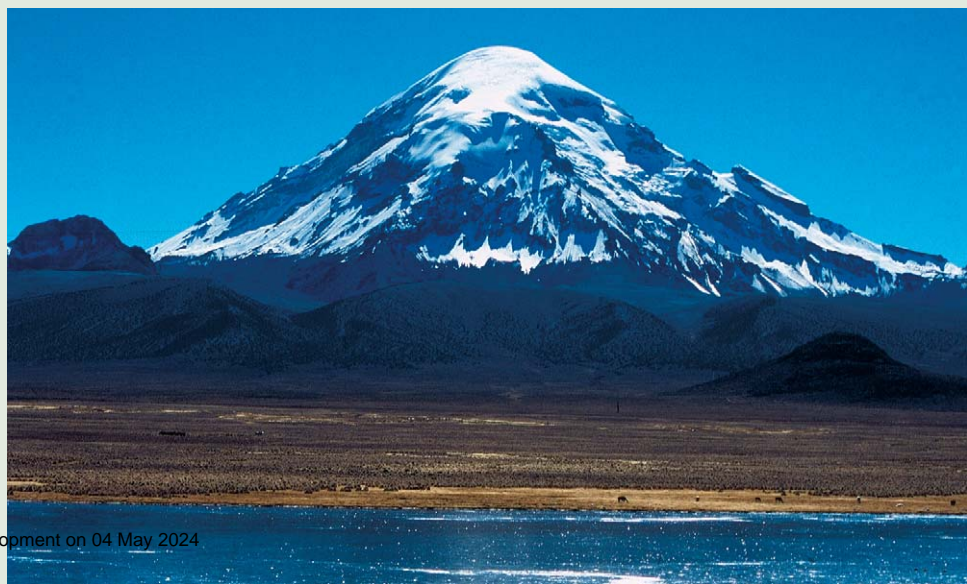
FIGURE 1 Nevado Sajama; in the foreground, a typical wetland.