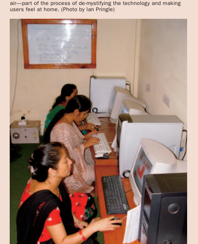
FIGURE 5 Housewives taking a computer course at the CMC in Tansen. Drawing on tradition and saving on furniture costs, the CMC set up computers on low tables so that users could sit on cushions on the floor. The arrangement helps to give the center a less formal

The CMC is introducing a membership system through which community members and volunteers are able to use the computer and Internet facilities. The team plans to expand the hours of cablecast programming to increase viewership and hopefully community support. The Local Programme has started to carry some small advertising with spots made by youth volunteers. The CMC offers paid video and production services for local weddings and other ceremonies. Youth who do the video shooting split the NPR 2000 fee (about USD 25) with the center. The CMC charges NPR 750 to mix wedding video footage. The center has started to offer limited, low-cost training programs. For example, 30 housewives are paying an average of NPR 900 (about USD 12) for a three-month course covering basic computers, word processing and Internet (Figure 5). The CMC is also planning to introduce on-demand music and video features for cable subscribers.