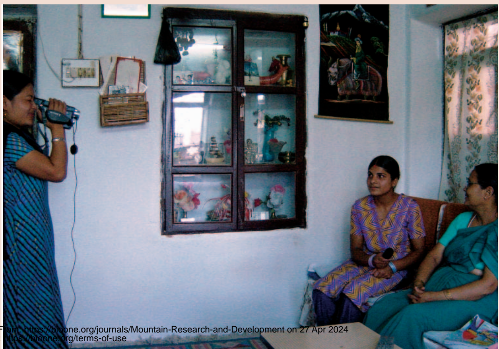
FIGURE 4 Two young producers film and conduct an interview as part of Jeevanko Goreto (Path of Life). The CMC's focus is on youth, and young women constituted a majority of the 174 participants that the CMC trained in the first year of the program.

Direct access to the Internet is also opening up new ideas and spaces for exploration. After a computer training program for 30 housewives, a handful of women have started using email to keep in touch with family members abroad. They also search the Internet for new recipes and hair styles to put to use in small businesses. To address the lack of good materials available in masters-level programs, the CMC is introducing a specialized course for local campus lecturers on searching and using the Internet.