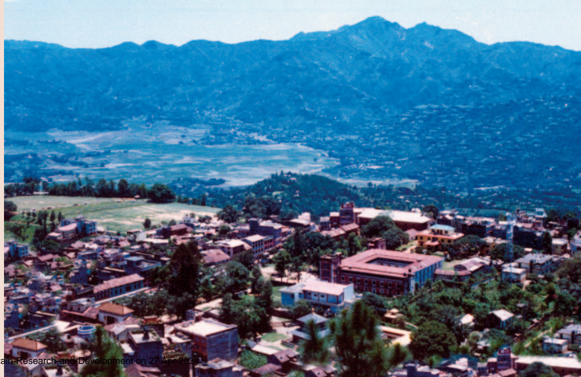
FIGURE 1 The center of Tansen town photographed from Shreenagar Park on the rim of the Madi valley. The CMC is located on the main bazaar road, which runs from the lower left to the center of the photo.

Historically a regional center, like many hill towns in the Himalayan belt Tansen is increasingly isolated from the plains where growth, trade and mobility are higher (Figure 1). Palpa also faces the pressures of migrating labor and instabili-