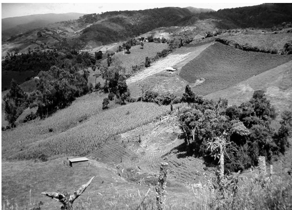
FIGURE 3 A panoramic view of the rural landscape showing the heterogeneity of land uses and the prominence of potato and corn cultivation. Note native trees surviving along the hedgerows, steep brooks, and other areas unsuitable for agriculture or grazing.

The expanding population and opening of new agricultural lands do not appear to have greatly affected the páramo border in the eastern range within the study site. A continuous 50-km stretch of intact forest