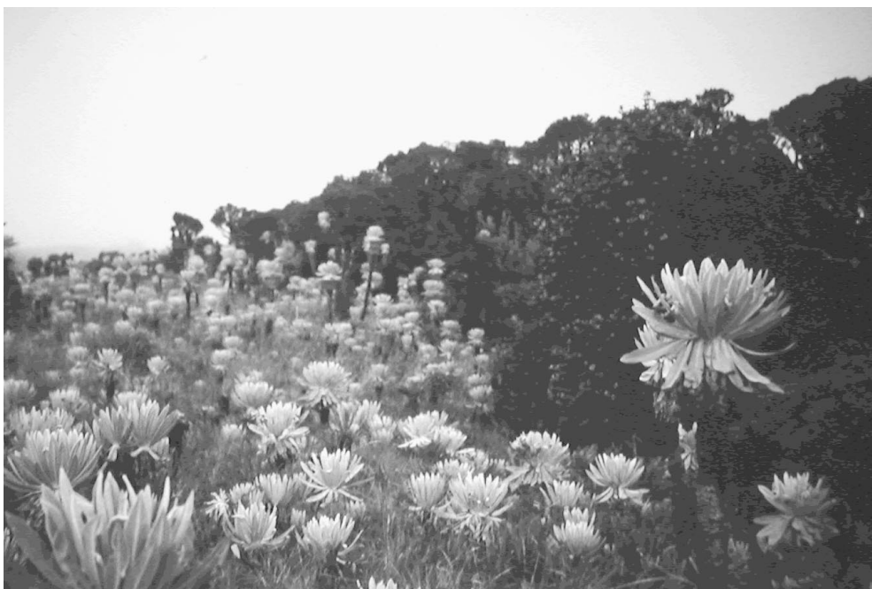
FIGURE 4 Distinctive anthropogenic boundary between the forest and the páramo in Nueva America. Note the straight line of the slope cut and the avoidance of ravines and brooks not suitable for grazing or agriculture. Often, semicircular shapes are observed as evidence of previous kilns for charcoal extraction.

The notion of anthropogenic community composition, landscape structure, and ecosystem function is a viable succinct explanation for Andean tree line dynamics, both in the upper and lower boundaries of the native TMCs (Figure 4). The simplified, temperate-based view of altitudinal vegetation belts moving up and down