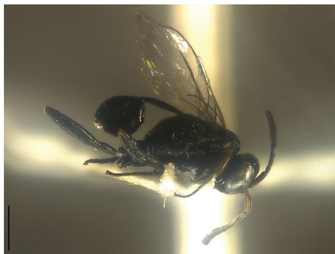
Fig. 2. Semaomyia sp. (Hymenoptera: Evaniidae). Scale bar: 500 \mu m.