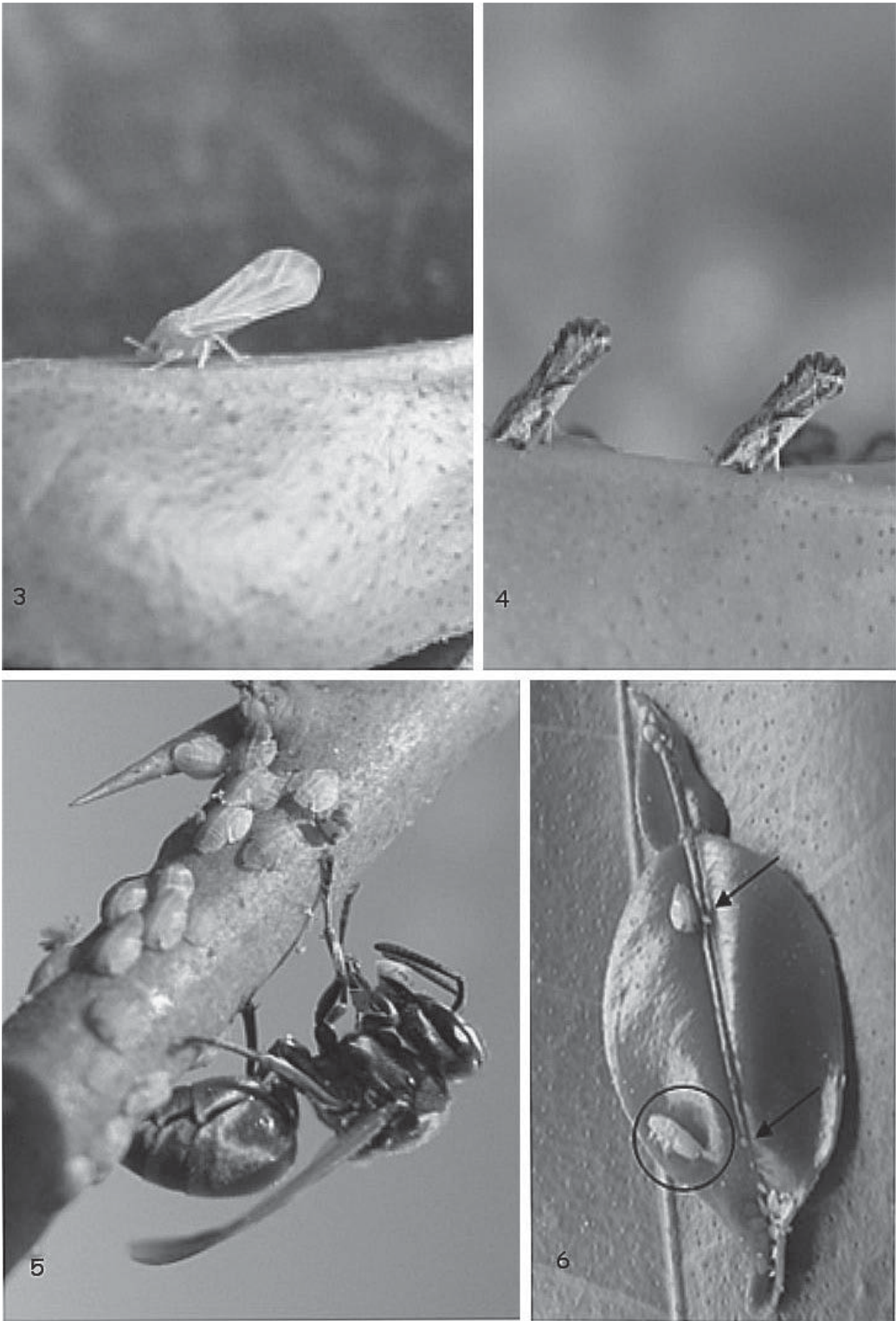
Figs. 3-6. 3. A non-melanized Diaphorina citri adult showing its characteristic white color, 4. Melanized adults of D. citri , 5. Brachygastra mellifica feeding on D. citri nymphs, and 6. Size comparison between a 1st instar (arrow) and a 5th instar (circled) D. citri nymph at Río Bravo, Tamaulipas, México.