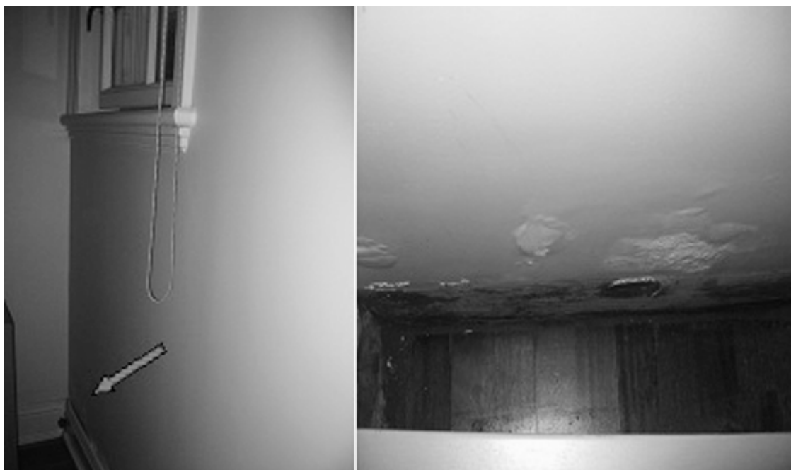
Fig. 3. Effect of high air humidity in basement.

All adult specimens were identified as a Cossoninae, Hexarthrum exiguum (Fig. 2). They are uniformly chestnut-brown in color and cylindrical, and have a typical broad-nosed appearance