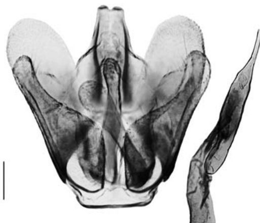
Fig. 2. Male genitalia of Leptodeuterochopos neales ; (same data as Fig. 1), slide DM 334. Scale line = 0.1 mm.

Two specimens have been identified from Florida. The first is a male collected at UV blacklight by J. B. Heppner, 29 April 1978, Dade Co.: Chekika State Recreation Area (Grossman Hammock) [FSCA] (Fig. 1). We have compared the male genitalia of this specimen (Slide DM 334) (Fig. 2) with a male from Mexico: Vera Cruz: Atoyac IV.18?? H. H. Smith, Slide CG 5059 [BMNH] as basis for the determination. The second specimen was retrieved from a CO 2 mosquito trap by R. A. Belmont, 10-25 June 1992, Collier Co.: Naples [DMC]. The second specimen is missing the lower abdominal segments but is recognizable by wing maculation. On first examination, specimens of L. neales may be mistaken for a common South Florida species, Sphenarches anisodactylus