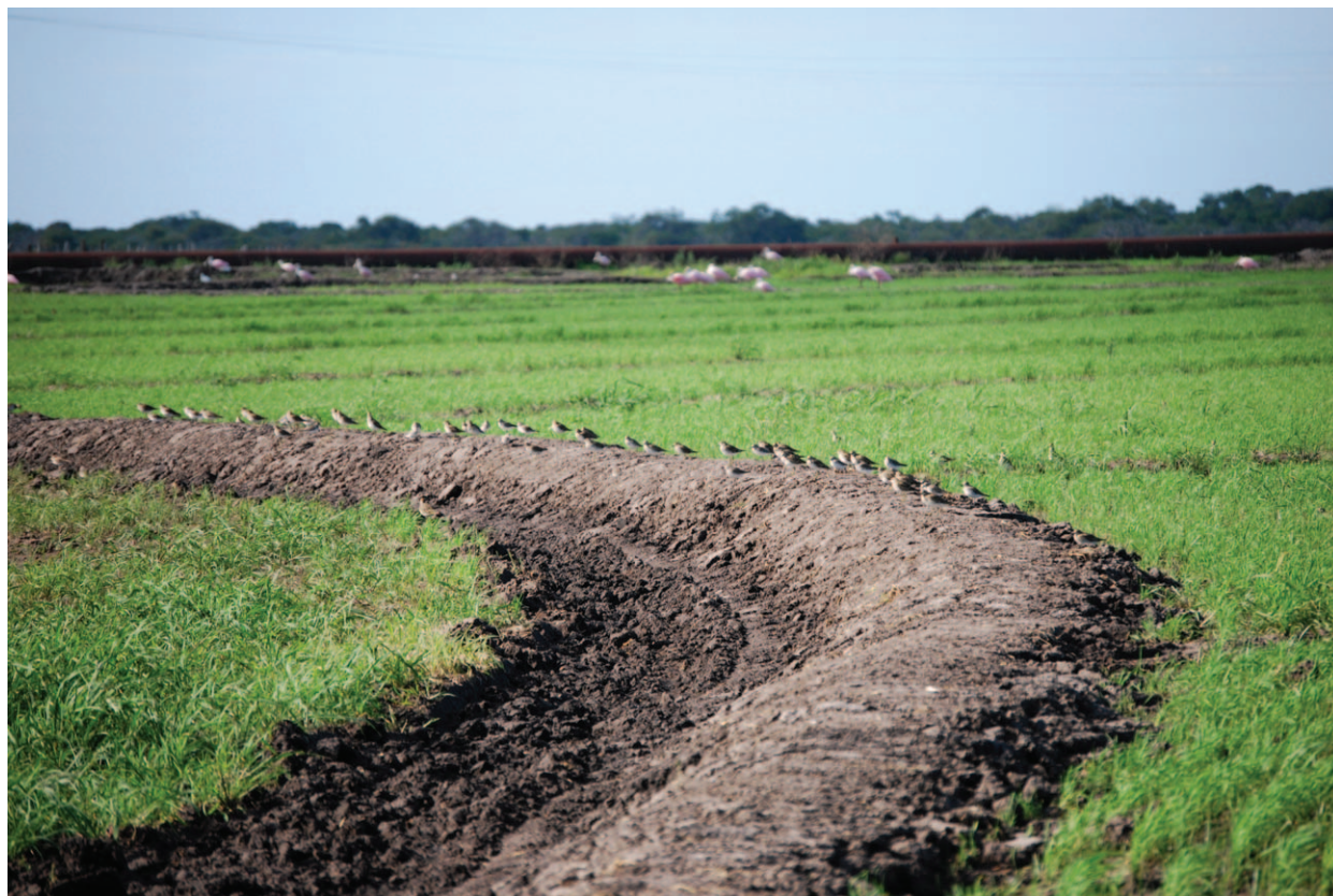
FIGURE 1. Shorebirds, mainly Pectoral Sandpipers ( Calidris melanotos ), resting on a levee in a rice field at Estancia La Lucha, Argentina, January 2010.

products can occur as late as the grain maturation phase depending on pest infestations.