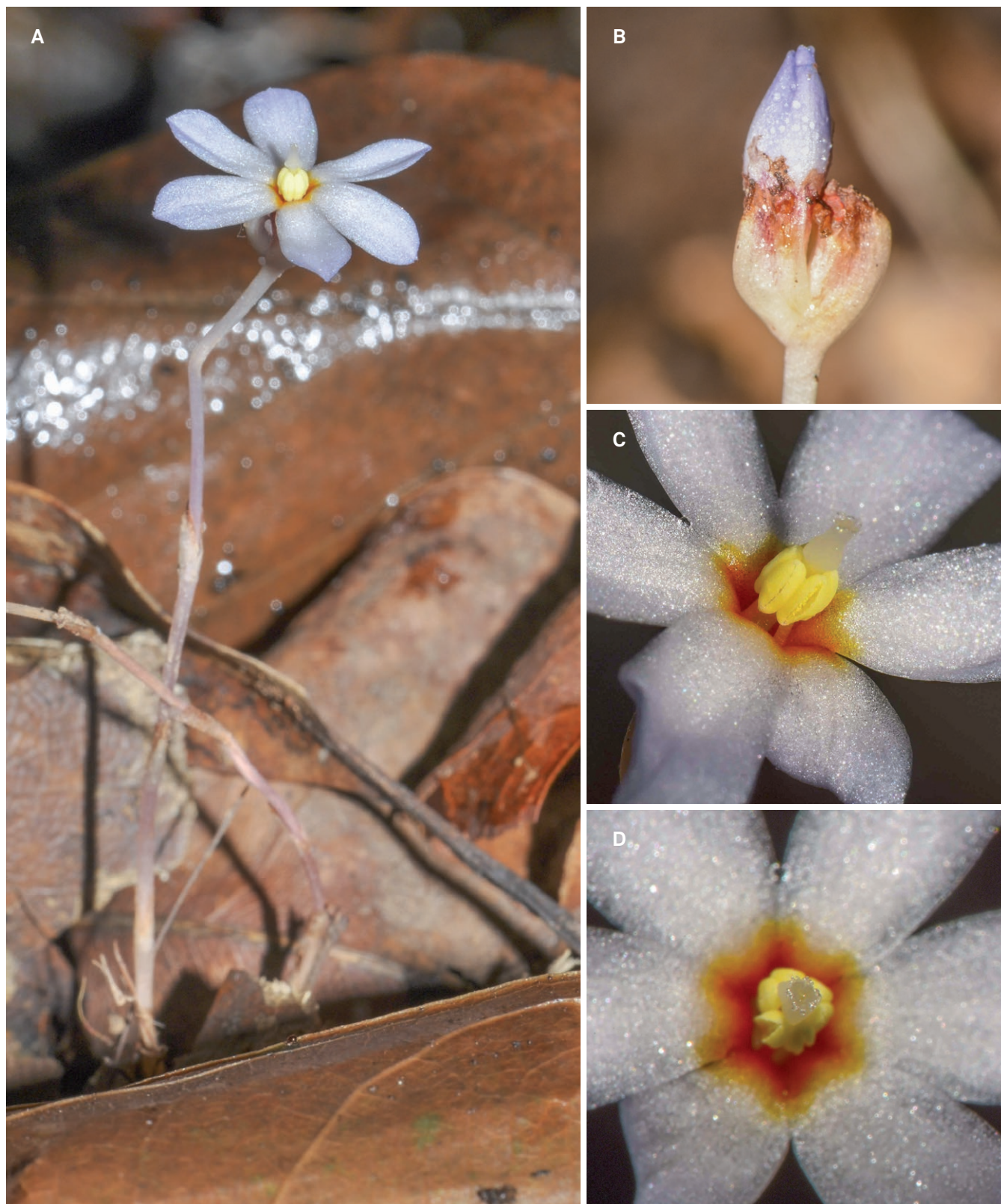
Fig. 3. – Geosiris australiensis B. Gray & Y.W. Low. A. Habit; B. Close-up of a flower bud with bracts; C. Close-up of extrorse stamens showing anthers with a longitudinal slit and forming a tight ring around the style; D. Top view of stigma showing truncate apex with short fimbriate margin.