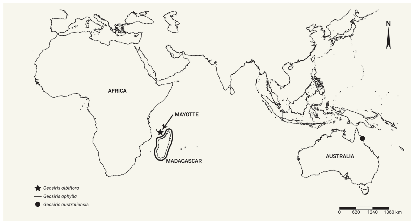
Fig. 4. – Distribution of the three Geosiris Baill. species.