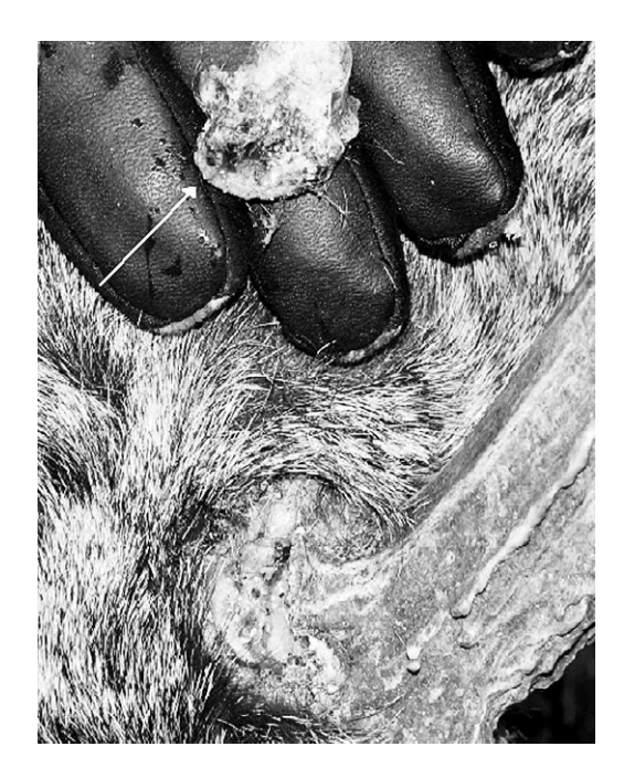
FIGURE 2. Exudate on the antler pedicle of 4.5-yr-old male white-tailed deer at Chesapeake Farms, Maryland, USA, 2006. Note the skull fragment that split away from the antler pedicle.

Maryland, USA, deer were positive for A. pyogenes. Other bacteria identified included Staphylococcus (n=6), Bacillus (n=4), Klebsiella (n=1), and Pseudomonas (n=1; Davidson et al., 1990; Baumann etal., 2001). Eighty percent (n=4) of the A. pyogenes results came from the nasopharyngeal samples. None of the Texas, USA, deer cultured positive for A. pyogenes. Other bacteria identified from Texas, USA, samples included Staphylococcus (n=8) and Bacillus (n=9). The failure to culture A. pyogenes from nasopharyngeal or antler base swabs suggests that presence of this organism associated with intracranial abscessation may be limited at our Texas, USA, site. It is possible the arid climate may discourage growth of A. pyogenes; however, our study design does not specifically address this question.