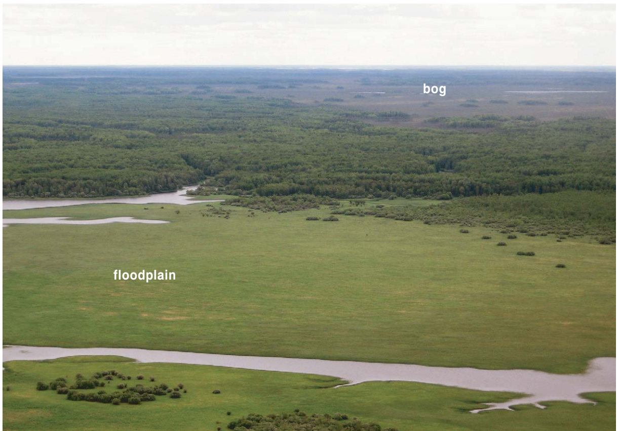
Figure 2. Floodplain and bog are separated by 1.5–2 km of forest near Mukhrino Field Station, where thunbergi and beema occur on either side of the forest ecotone.

allocated in a broad zone of sympatry of both taxa, which in Western Siberia is roughly between 55°–60°N (Red'kin 2001, Ryabitsev 2008). Since thunbergi and beema are long-distance migrants (Glutz von Blotzheim & Bauer 1985) we are keen to distinguish occasional migrants from breeding birds. Migrants can turn up in any damp habitat, a potential pitfall when studying the birds' breeding habitat. To minimize confusion we decided to only use observations of feeding or strongly alarming parents, indicating the presence of (fledged) juveniles. Upon finding birds meeting our criteria we established their sub-specific identity. Fortunately, males of both taxa are easy to separate in the field: thunbergi males have a distinctive all dark head and a yellow throat, whereas beema males have a light, blue-grey head, a strong supercilium and a white throat (Alström & Mild 2003). There is controversy over the taxonomic status of dark-headed birds east of the Ural Mountains. These birds are widely recognized as belonging to the taxon plexa (Tyler 2004) but the validity of the taxon has been a subject of debate. Alström &