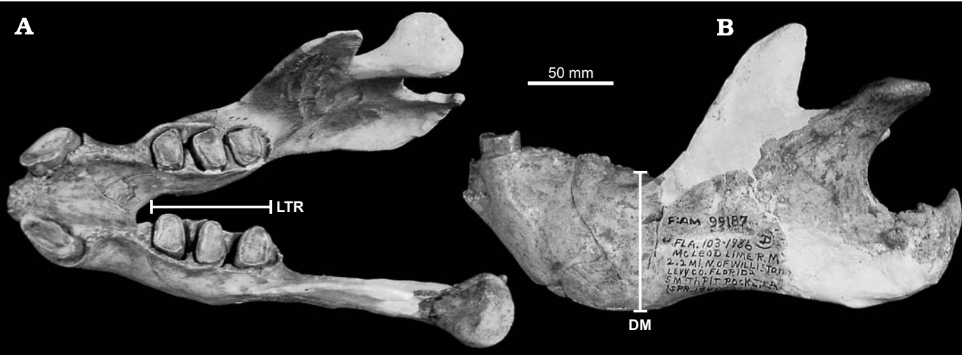
Fig. 1. Measurements used to calculate hypsodonty index (HI) in Megalonyx . HI is calculated as the depth of the mandible (DM), usually measured below the third molariform tooth (see B), divided by the length of the tooth row (LTR; see A), and multiplied by 100. Specimen displayed is AMNH F:AM 99187—mandible of Megalonyx wheatleyi from the middle Irvingtonian McLeod Mine, Florida, in occlusal (A) and lateral (B) views.

mean HI value of Megalonyx is closest to that of Megatherium americanum (mean HI = 1.02) reported by Bargo et al. (2006). Statistical analyses revealed no differences in HI for Megalonyx across ontogeny, time, or space (see Table 2): (1) Ontogeny: juveniles from the Blacan of Florida: mean HI = 1.06, SD = 0.10, n = 3; adults from the Blacan of Florida: mean HI = 1.10, SD = 0.04, n = 2; results of comparison of both samples using Kruskal-Wallis test: H = 0.3333; df = 1; p = 0.5637. (2) Temporal: specimens from Blacan: mean HI = 1.08, SD