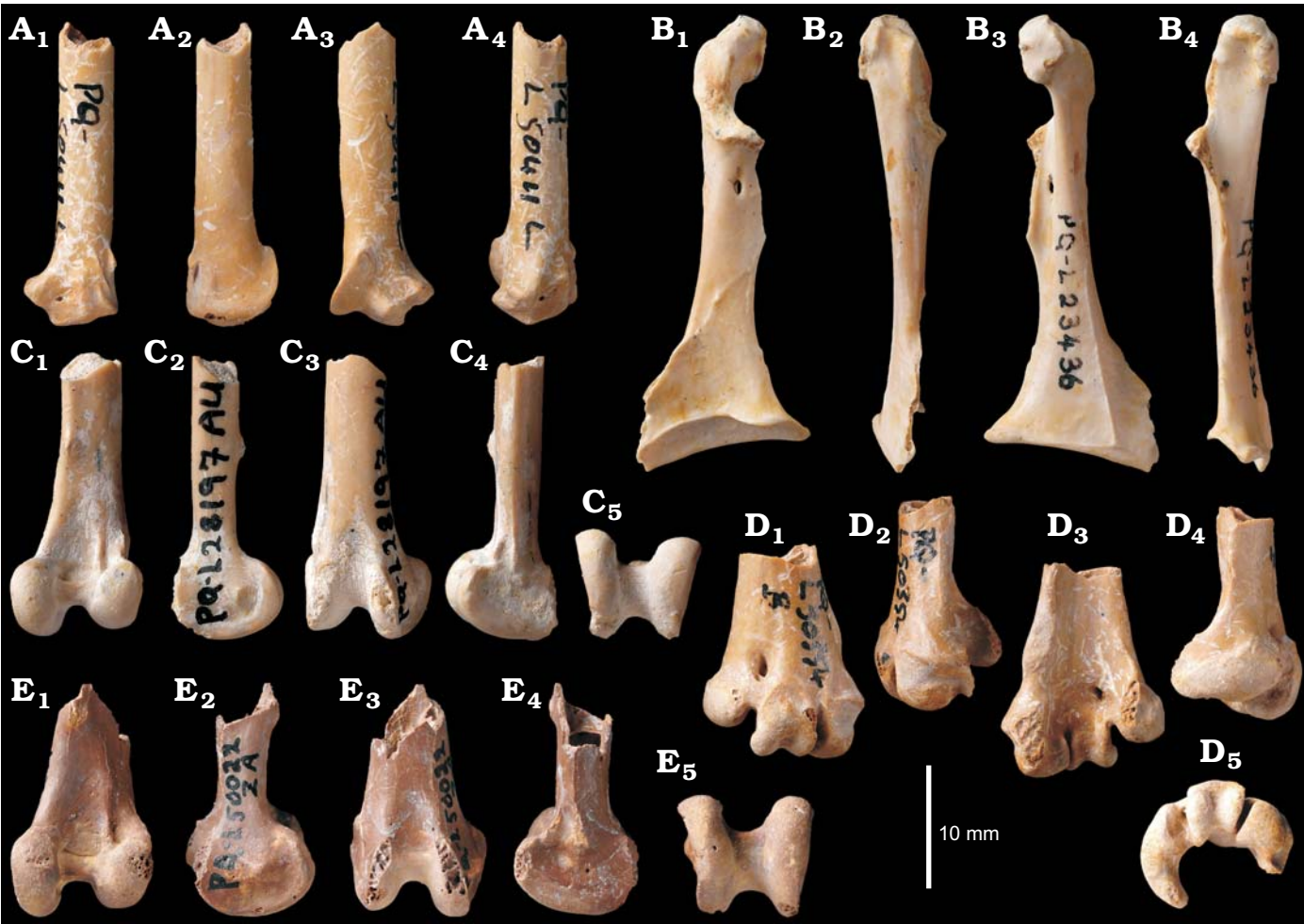
Fig. 1. Tytonid owl Tyto richae sp. nov. from the early Pliocene, Upper Varswater Formation at Langebaanweg, South Africa; paratypes (A–C, E), holotype (D). A. Left ulna (SAM-PQ-L50411 L), in dorsal (A 1 ), caudal (A 2 ), ventral (A 3 ), and cranial (A 4 ) views. B. Left coracoid (SAM-PQ-L23436), in dorsal (B 1 ), lateral (B 2 ), medial (B 3 ), and ventral (B 4 ) views. C. Left tibiotarsus (SAM-PQ-L28197 AU), in cranial (C 1 ), lateral (C 2 ), caudal (C 3 ), medial (C 4 ), and distal (C 5 ) views. D. Right tarsometatarsus (SAM-PQ-L50354 B), in dorsal (D 1 ), lateral (D 2 ), plantar (D 3 ), medial (D 4 ), and distal (D 5 ) views. E. Left tibiotarsus (SAM-PQ-L50022 ZA), in cranial (E 1 ), lateral (E 2 ), caudal (E 3 ), medial (E 4 ), and distal (E 5 ) views.

Compared to T. alba , the condylus ventralis ulnae of T. richae sp. nov. does not protrude as far ventrally and the incisura tuberculi carpalis is less marked. In cranial view, the distal tibiotarsus of Tyto richae sp. nov. is characterized by a small crest proximal to the medial side of the condylus lateralis. A similar crest is also present in T. sanctialbani , but is absent in