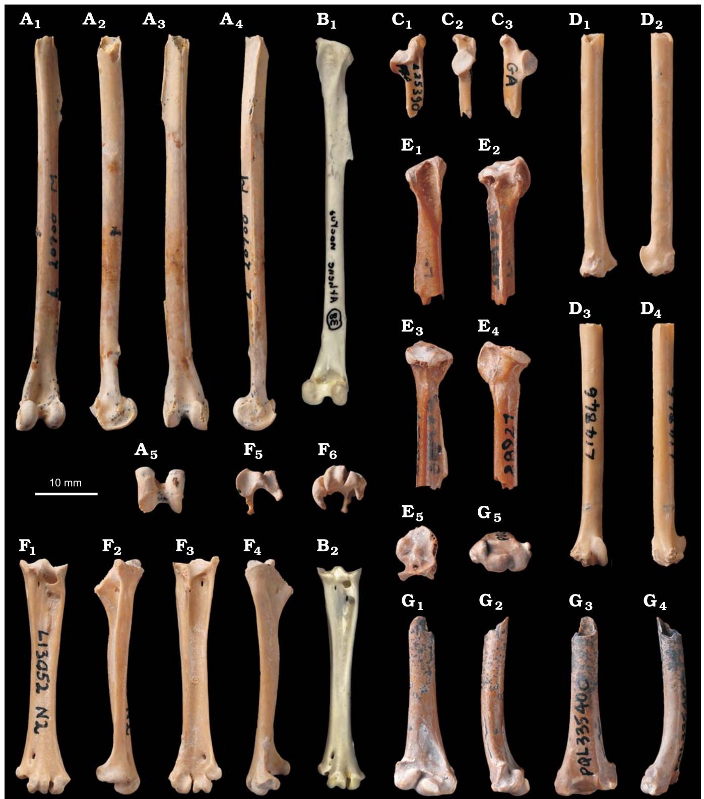
Fig. 2. Strigid owl Athene inexpectata sp. nov. from the early Pliocene, Upper Varswater Formation at Langebaanweg, South Africa; paratypes (A, C–E, G), holotype (F) and Athene noctua , Recent (B). A. Left tibiotarsus (SAM-PQ-L20700 M), in cranial (A 1 ), lateral (A 2 ), caudal (A 3 ), medial (A 4 ), and distal (A 5 ) views. B. Reversed right tibiotarsus (MGPT-MPOC 38), in cranial view (B 1 ), left tarsometatarsus in dorsal view (B 2 ). C. Left scapula (SAM-PQ-L25390 GA), in medial (C 1 ), cranial (C 2 ) and lateral (C 3 ) views. D. Right ulna (SAM-PQ-L14846), in dorsal (D 1 ), caudal (D 2 ), ventral (D 3 ) and cranial (D 4 ) views. E. Right tibiotarsus (SAM-PQ-L28927), in cranial (E 1 ), lateral (E 2 ), caudal (E 3 ), medial (E 4 ), and proximal (E 5 ) views. F. Right tarsometatarsus (SAM-PQ-L13052 N2), in dorsal (F 1 ), lateral (F 2 ), plantar (F 3 ), medial (F 4 ), proximal (F 5 ), and distal (F 6 ) views. G. Right humerus (SAM-PQ-L33540 C), in cranial (G 1 ), dorsal (G 2 ), caudal (G 3 ), ventral (G 4 ), and distal (G 5 ) views.