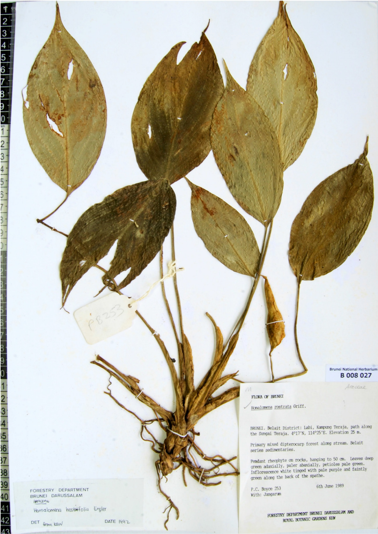
Fig. 3. Homalomena scutata – holotype specimen: P. C. Boyce 253 (BRUN – B 008 027).