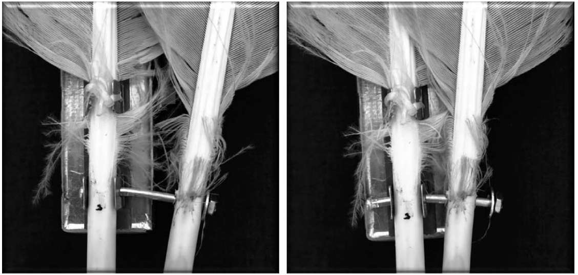
Figure 2. Attachment detail (ventral view) of 22-g solar-powered GPS PTT on molted central rectrices of a Golden Eagle. Note PTT is mounted dorsally to one central rectrix (see Fig. 1). Distal PTT attachment tab is sutured to rachis with veterinary suture material. Proximal tab is attached with modified aluminum 3.2-mm pop-rivet pin extending between calami to distribute weight and permit rectrices to spread and contract to minimize stress on follicles. Pin is approximately 2 mm in diameter, cut to individual length (ca. 2.5–3 cm), and fixed with a flat washer and force-threaded nut secured with cyano-acrylic glue. Left pane shows feathers spread, right pane feathers relaxed. Ventrally mounted PTT attachment (see Fig. 1) is equivalent but accessed dorsally.

summer (Jollie 1947, Ellis and Kery 2004, A. Harmata unpubl. data).