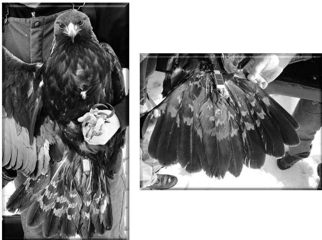
Figure 1. Satellite-tracked Platform Transmitter Terminals on central tail feathers of adult Golden Eagles. Left: 32-g battery-powered Doppler unit on male. Right: 22-g solar powered GPS unit on female.

October were considered residents. Eagles located outside Montana at any time during tracking were considered migrants. Resident adults observed engaged in breeding behavior or commonly associated with nest sites or another adult eagle of distinctly dissimilar size were considered territorial and mated. Resident adult eagles not commonly observed associated with nest sites or another adult eagle of distinctly dissimilar size and ranged widely were considered floaters (Brown 1969, Hunt 1998) and were assumed to be unmated. Nonadult eagles were classified as either resident or migrant based on above criteria.