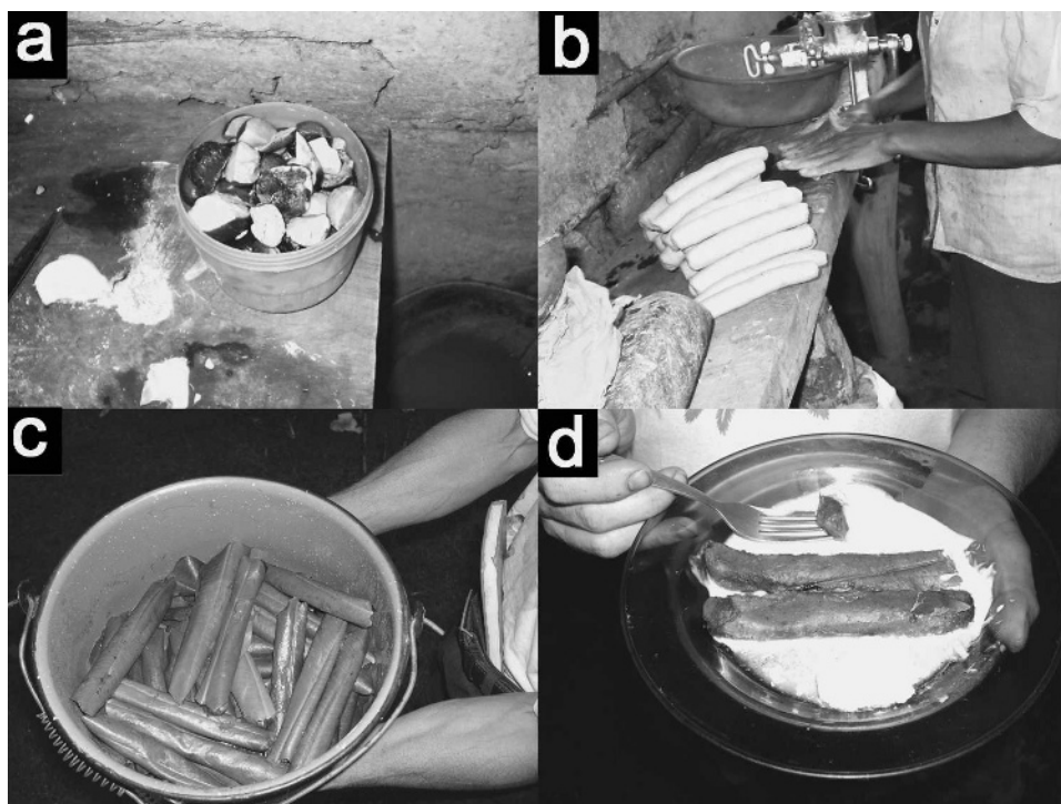
FIGURE 8.— Tamales de tiusinte : (a) chopped-up and cooked seeds; (b) shaped masa ; (c) wrapped in jucuyul leaves and cooked; (d) eaten with mantequilla .

Seeds for immediate consumption are split open (usually by girls) with rocks. The white, starchy kernels ( comida or producto ) are broken into small pieces as the second step in the preparation of all tiusinte food products. From that point on, however, techniques of preparation and types of products prepared vary from family to family, village to village, and municipality to municipality.