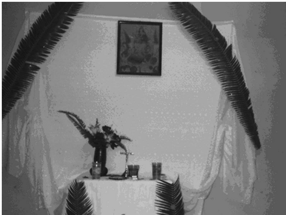
FIGURE 10.— Pencas de tiusinte ( Dioon mejiae ) in a household altar in Juticalpa, Olancho.

and partly with the Christmas season. Nativity scenes in Esquipulas del Norte contain tiusinte leaves. In Olanchito, the tiusinte leaf is associated primarily with the 24 th of December and minimally with death (e.g., tiusintes once grew next to gravestones in the public cemetery).