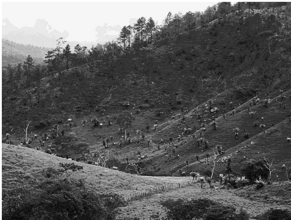
FIGURE 3.—Pasture with tiusintes in Saguay, Gualaco, along the Quebrada de los Hornos. Clearance of the tropical deciduous forest finca has taken place since 1990; tiusintes, respected as common-property resources, were not intentionally removed, and as hardy woody species, managed to survive repeated fires. Over time, however, serious degradation of the remaining tiusintes has occurred.

permission from interviewees to include video clips in a 2003 Spanish-language educational video that he produced (“El otro teocinte”); Bonta and Zúniga’s footage was used solely for research analysis.