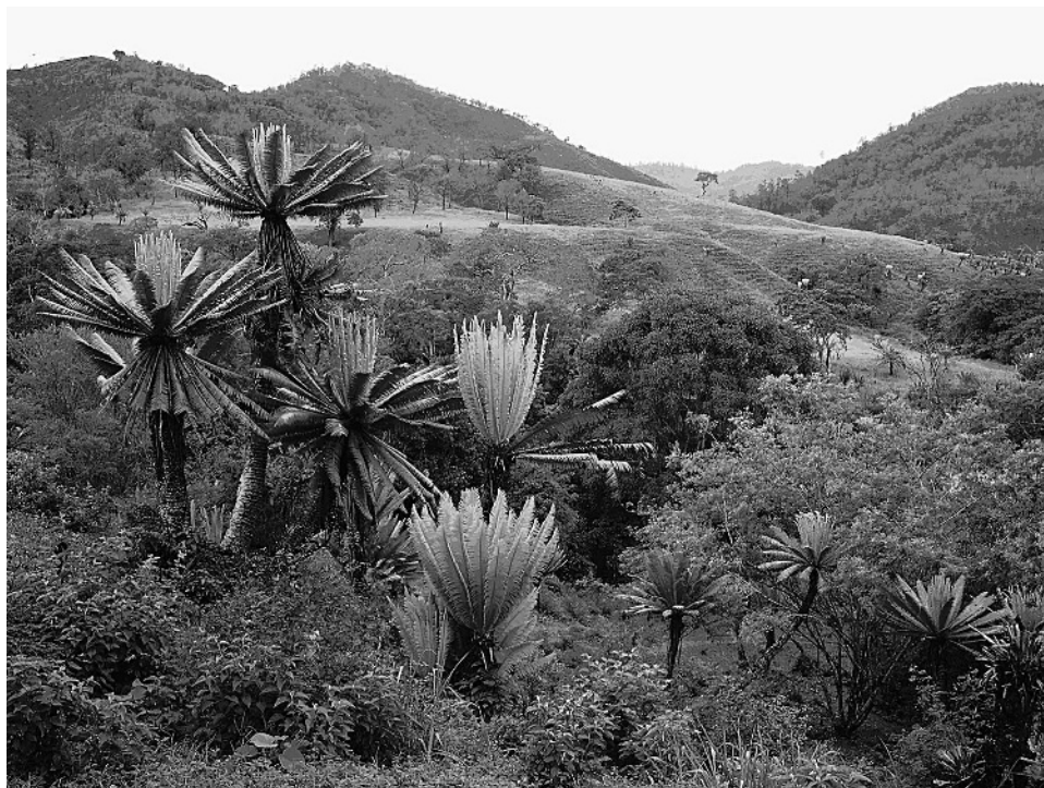
FIGURE 4.—Remnant of the Saguay, Gualaco tiusintal , referred to locally as the finca . Tall tree in left foreground is seven meters in height; lighter-colored leaves are the present year's flush ( vestimento ). Middleground habitat is dense gallery forest along the Quebrada de los Hornos; slopes in the background are cloaked in pasture and tropical deciduous broadleaf forest and scrub. Altitude 600 m above sea level.

we did not conduct research during the days when tiusinte use is most prevalent (e.g., Semana Santa [Easter Week], Día de los Muertos [All Souls' Day], Noche Buena [Christmas Eve], and bishops' visits).