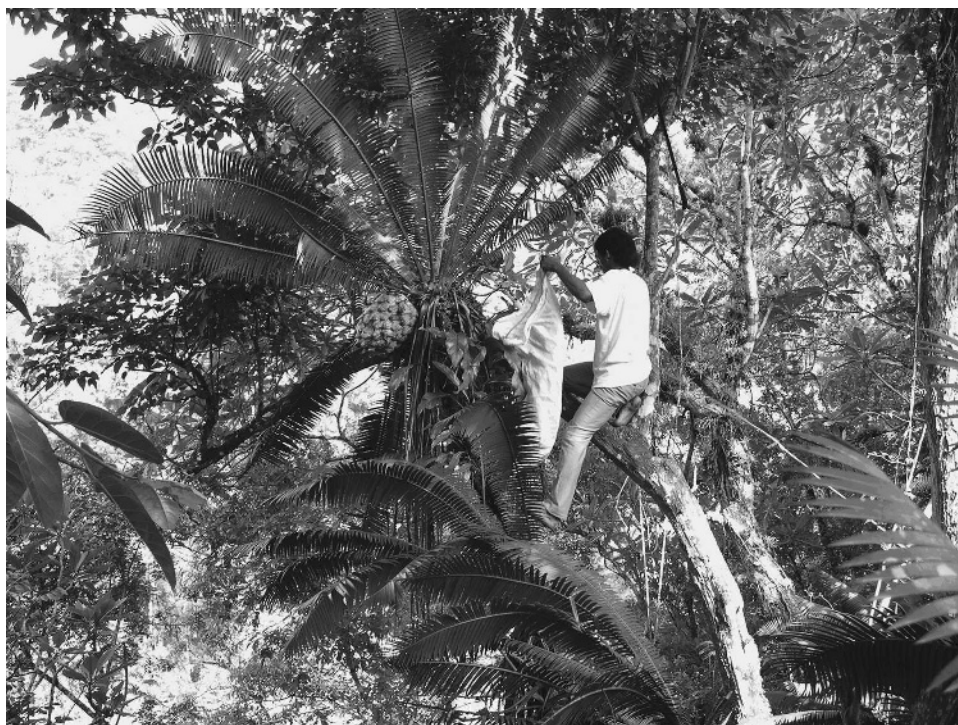
FIGURE 5.— Tiusintero in Río de Oro, Gualaco, preparing to harvest a large cone from a tiusinte overhanging a precipice.

tiusinte could be “stretched,” combined with other foods to tide the family through until the first maize harvest, which in some cases could be as late as September.