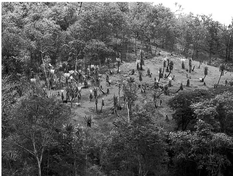
FIGURE 2.—Seven- to nine-meter tiusintes survive in a recently-cleared pasture on the ecotone between gallery forest along the Quebrada de los Hornos (Saguay, Gualaco), and deciduous tropical broadleaf forest upslope. This figure illustrates an early stage in conversion from finca to pasture; Figure 3 shows a later stage.

populations and users. The intent of the 2003 expedition was to visit as many wild populations as possible within the time frame allotted and to gather plant materials for a variety of scientific purposes (see Haynes and Bonta 2003; vouchers were deposited at TEFH). Ethnobotanical data were gathered using the methods described in the following sections.