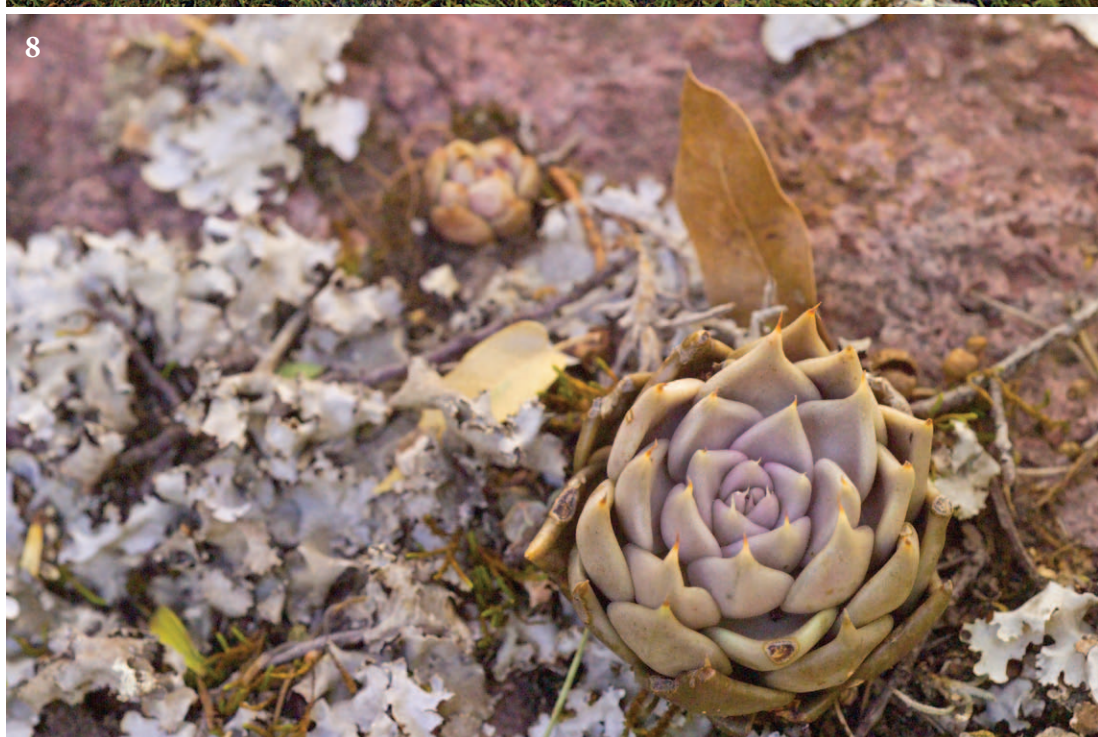
7 A beautiful adult specimen of Echeveria tobarensis growing on top of a mossy rock. 8 The similar colors of rock, lichen and plant make it difficult to spot the rosettes of Echeveria tobarensis .

genera consisting of only a few species and the three were moved back into the genus Echeveria as E. agavoides , E. purpurorum and E. tobarensis . The genus Echeveria is currently divided into 17 series (Walther, 1972; Kimnach, 2003).