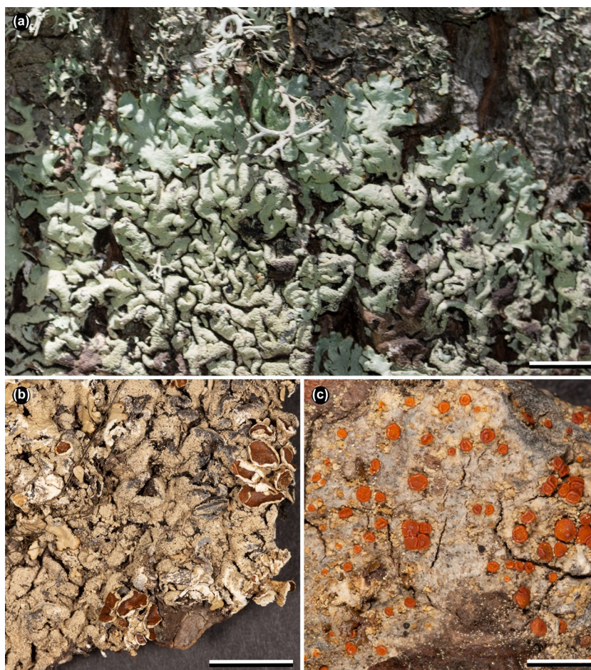
Figure 2. Blastenia monticola and Hypogymnia laminisorediata , general habit. A: H. laminisorediata on P. heldreichii in site Yavorov Chalet. B: H. laminisorediata SOMF 24313, locality 14-12, on P. peuce . C: B. monticola SOMF 31122, locality 14-3, on P. heldreichii . Scale bars: A and B = 1 cm, C = 2 mm.

However, a specimen of L. cadubriae collected by A. Vězda (14-15) was found, and the species was also collected during the fieldwork at the site Treshtenik Chalet (15-4).