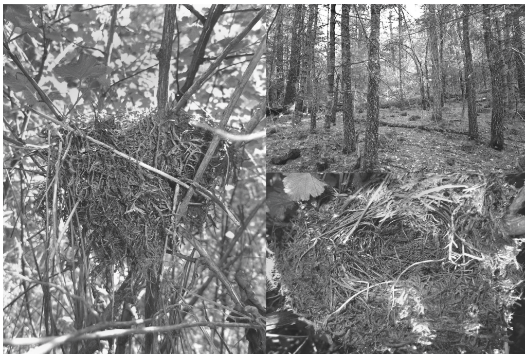
Figure 2. The environs and possible nest of Russet Nightingale-Thrush Catharus occidentalis , Sierra del Carmen, Coahuila, Mexico, June 2007. Clockwise from left: an old nest from the side, with dense moss still largely intact, but most pale twigs / grass have fallen off (some still visible hanging from the nest); the steep slopes of the ravine in which the nest was sited; the same nest from above, showing the thickness of the moss cup and the carefully constructed lining of rootlets and conifer needles (Eliot T. Miller)

pale grey. The bird sang almost continuously until we left at 10.15 h. We returned on 7 June 2007 and were able to record two brief song bouts using a digital camera ( http://www.xeno-canto.org/357625 , http://www.xeno-canto.org/357626 ). A bandpass-filtered version has also been uploaded to Macaulay Library (ML85671051), where the identification was confirmed by reviewers. Near the singing bird, we noted the presence of at least four old nests that resembled those of other Central and South American Catharus and Turdus species (ETM, H. F. Greeney & V. Rohwer pers. obs.; Fig. 2). We departed the study site on 10 June 2007, and made no further observations of the bird. This site is c.425 km north of the nearest known population, near Monterrey, Nuevo León. While our evidence of breeding is far from conclusive, the large number of nightingale-thrush-like nests in the ravine, and extensive singing throughout the day for 24 days suggests at least a male advertising for a mate.